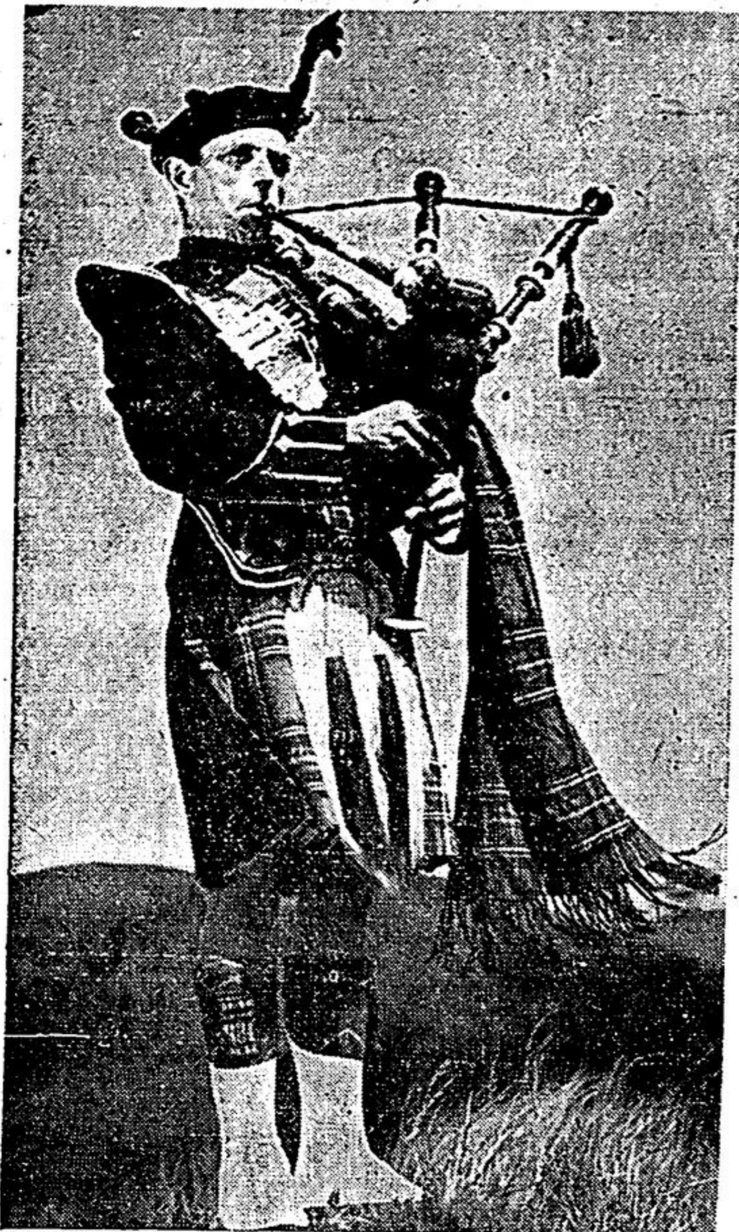
Officers of the newly formed Canadian Scottish battalion went shopping in Edinburgh for 1,500 kilts, but even the wary Scots did not have such a