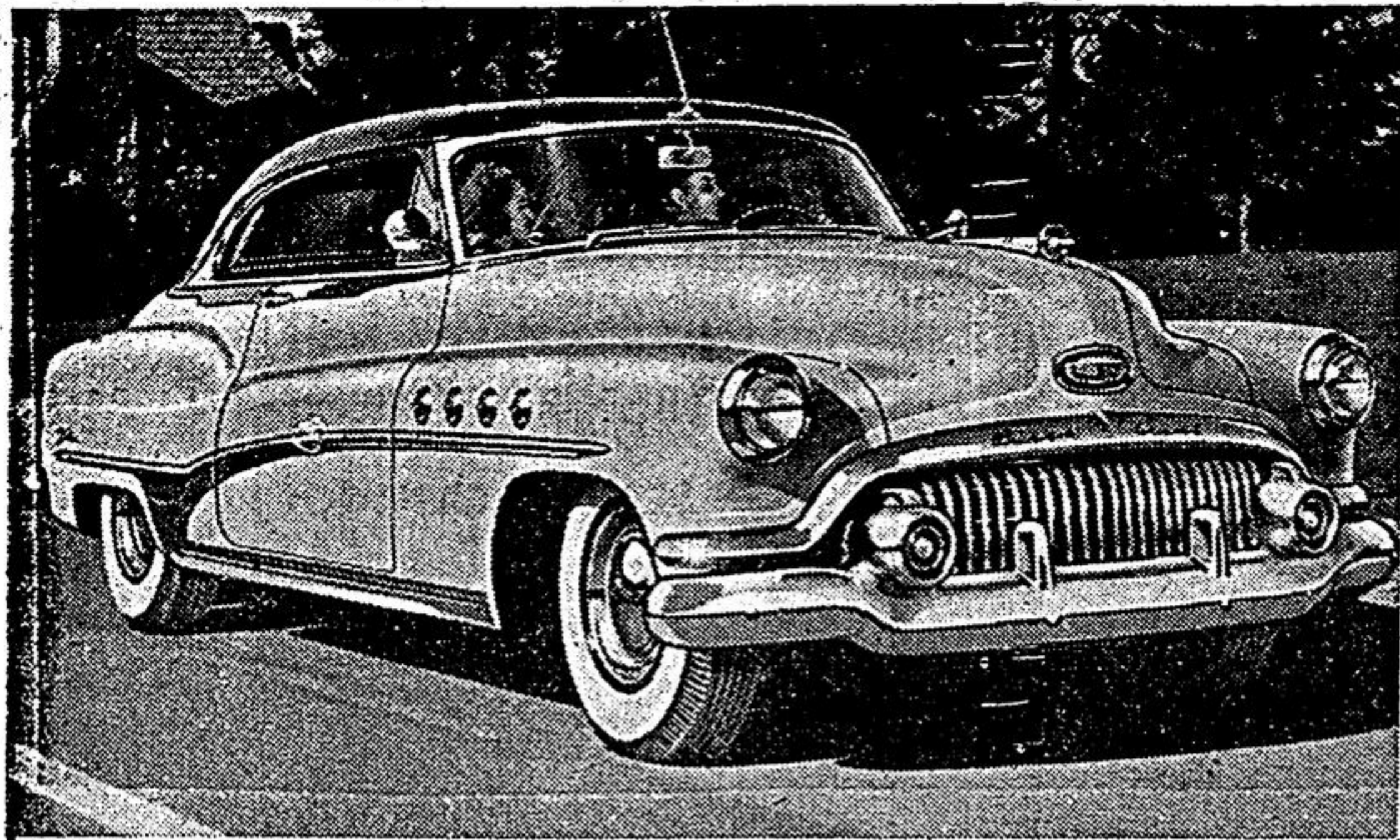
THE NEW 1951 BUICK offers Dynaflo automatic transmission as standard equipment on the Roadmaster series and as an option at extra cost on the Custom series. Buick marks its return to Canada after an absence of three years with completely new bodies, a new grille which flexes with the bumper, reducing the possibility of damage, the famed Riviera styling in certain models, new brakes, a choice of two new and more powerful Fireball engines and many mechanical features. Buick for 1951 offers a variety of models including a convertible and two "hard-top" convertibles. Shown here is the Buick Roadmaster Riviera "hard-top" convertible.