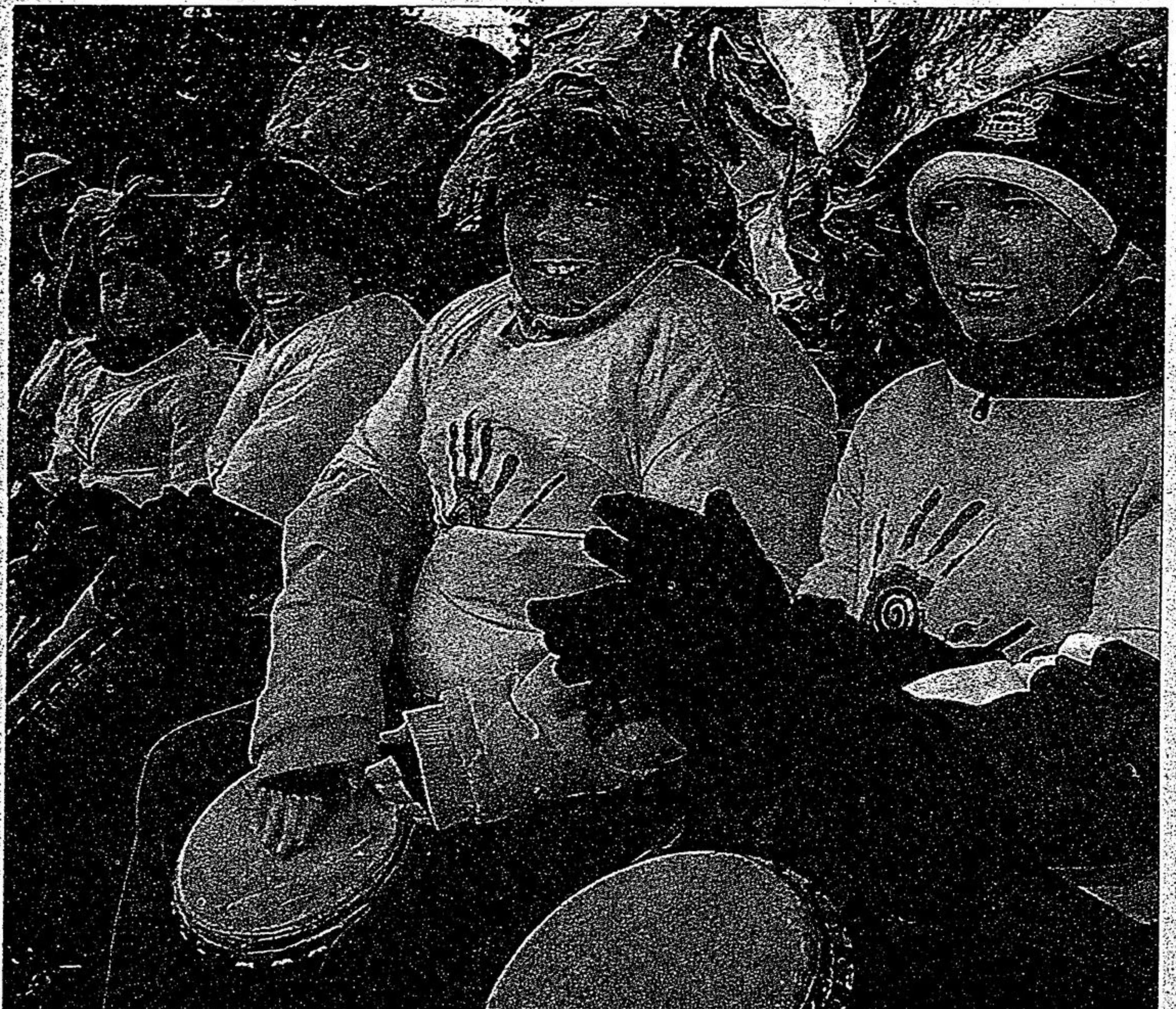
The Summitview Public School drum band keep the best in spite of the weather.