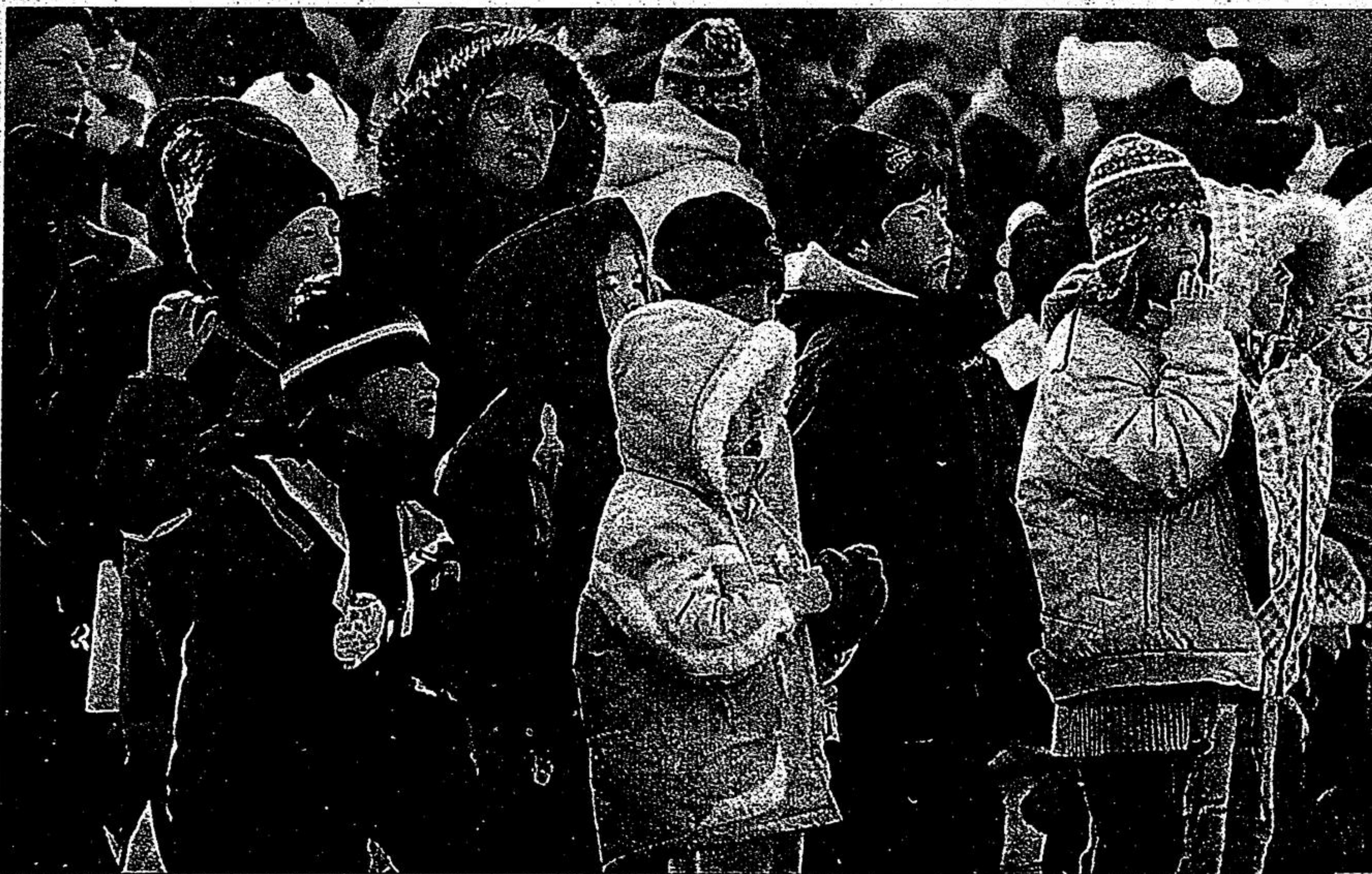
Part of the big crowd gathered along Main Street to see Santa Claus and 50 other entries.