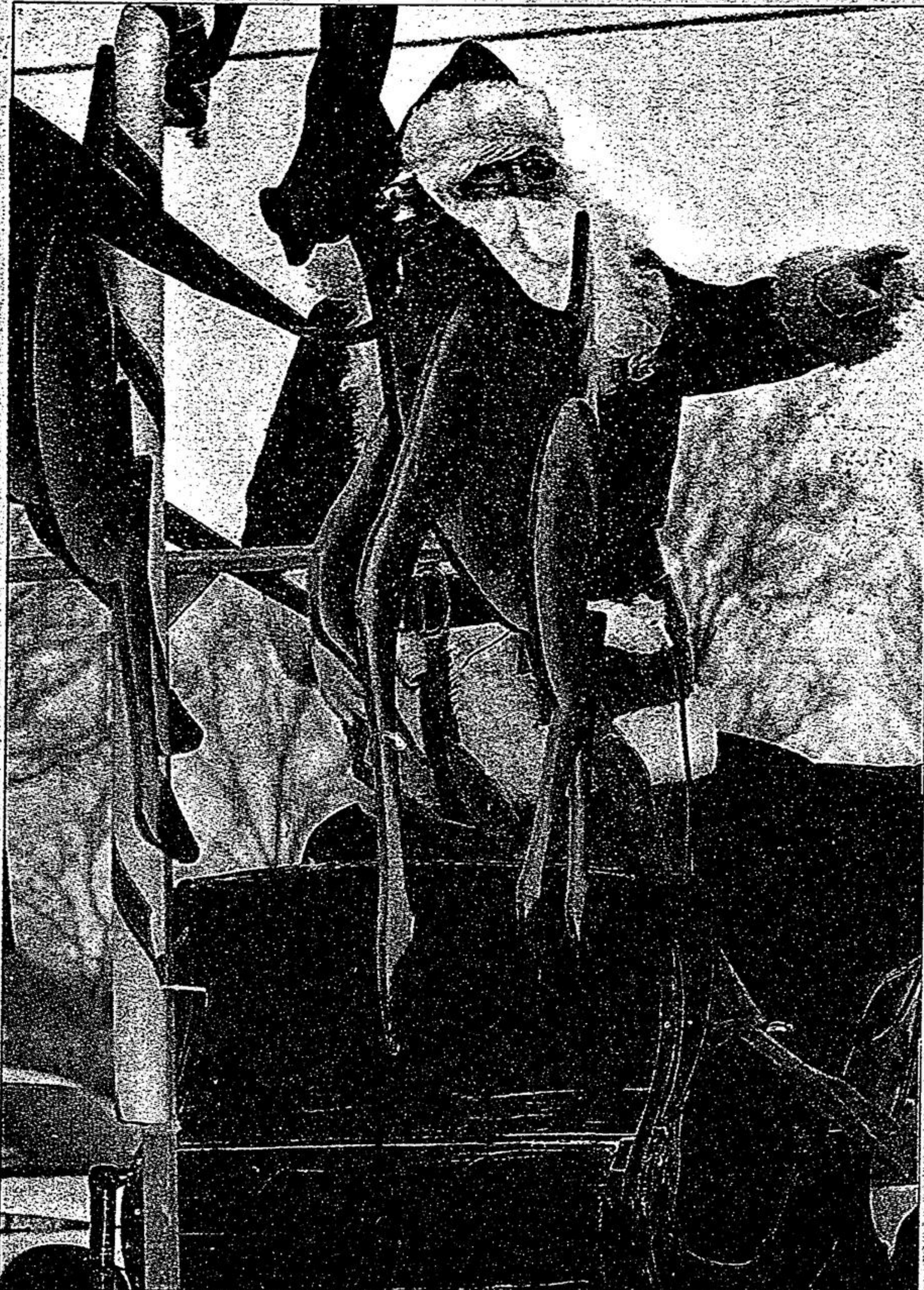
Santa waves to children of all ages along the parade route.

FOR ADDITIONAL PHOTOS, GO TO YORKREGION.COM AND CLICK ON PHOTO GALLERY