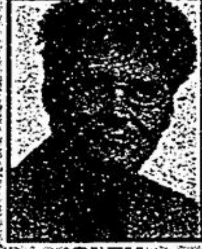
OLEH KOBYLECKY* www.classichomes.ca