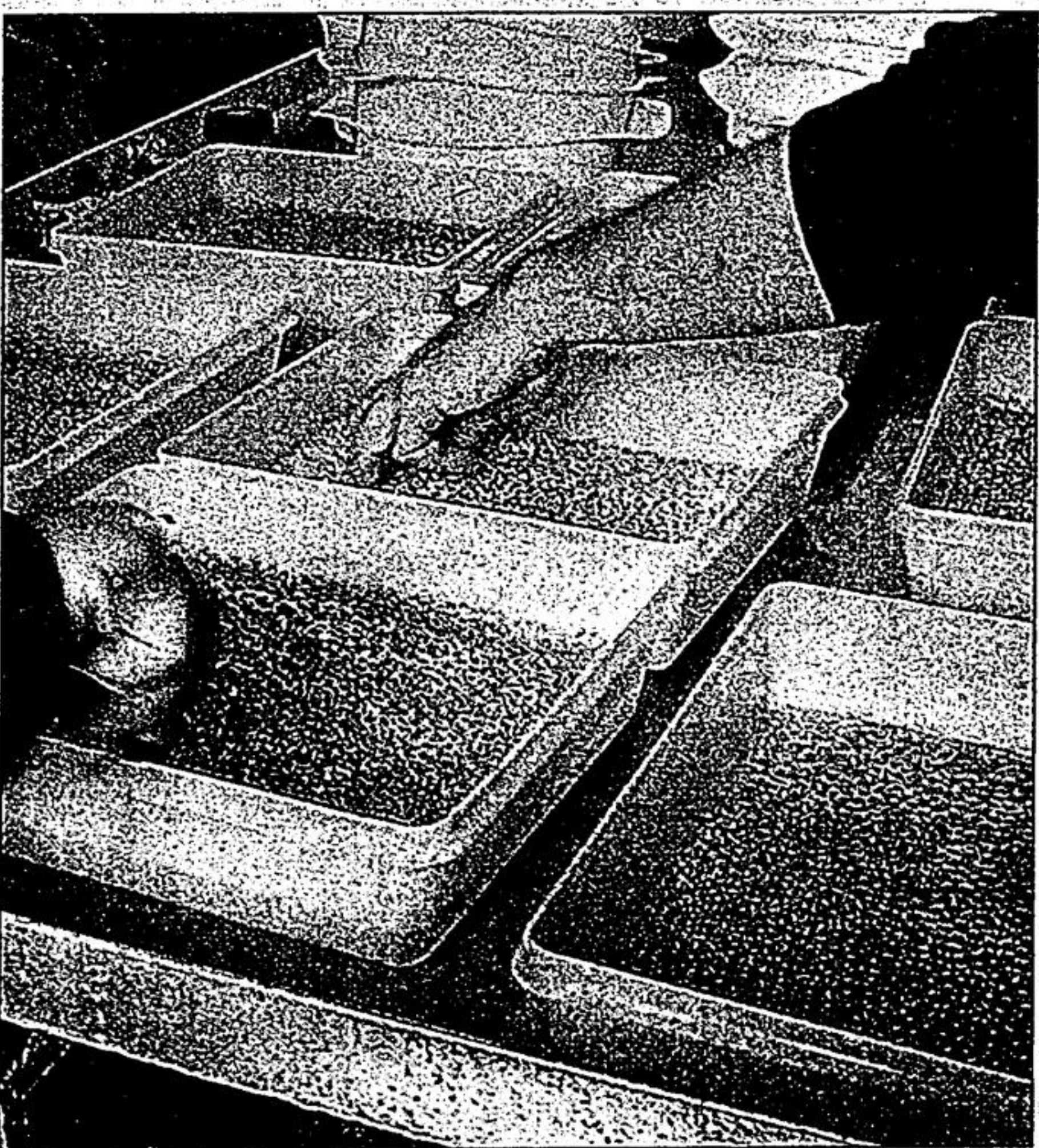
Harvested eggs go back into the system at Ringwood.