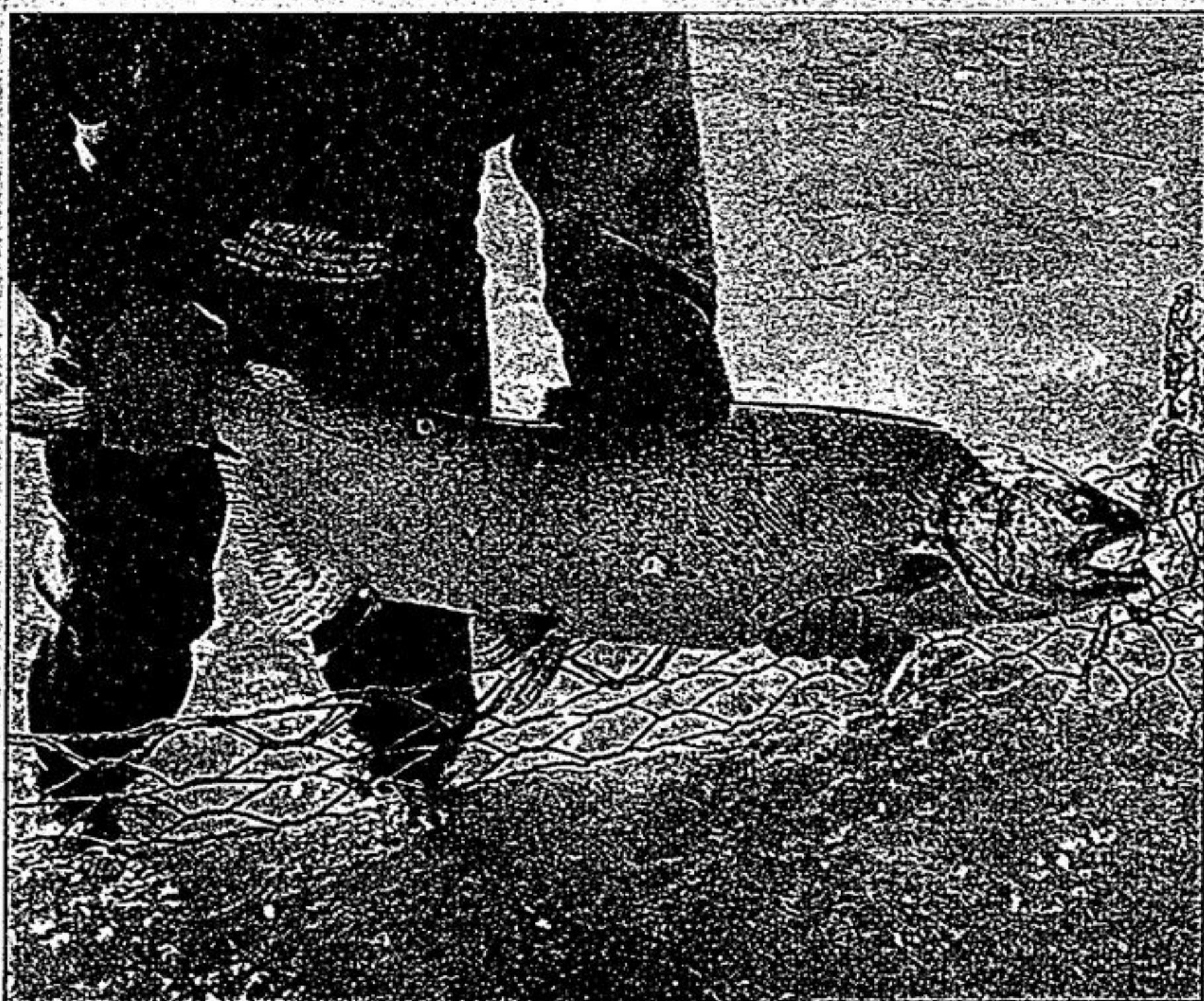
One of the big beauties captured on the Credit River.

Volunteers from the OFAH/Toronto Sportsmen's Show Ringwood Fish Culture Station in Whitchurch-Stouffville worked with fisheries biologists from the Ontario Federation of Anglers and Hunters during the first two weeks of October to collect eggs from spawning chinook salmon in the Credit River, near Streetsville.