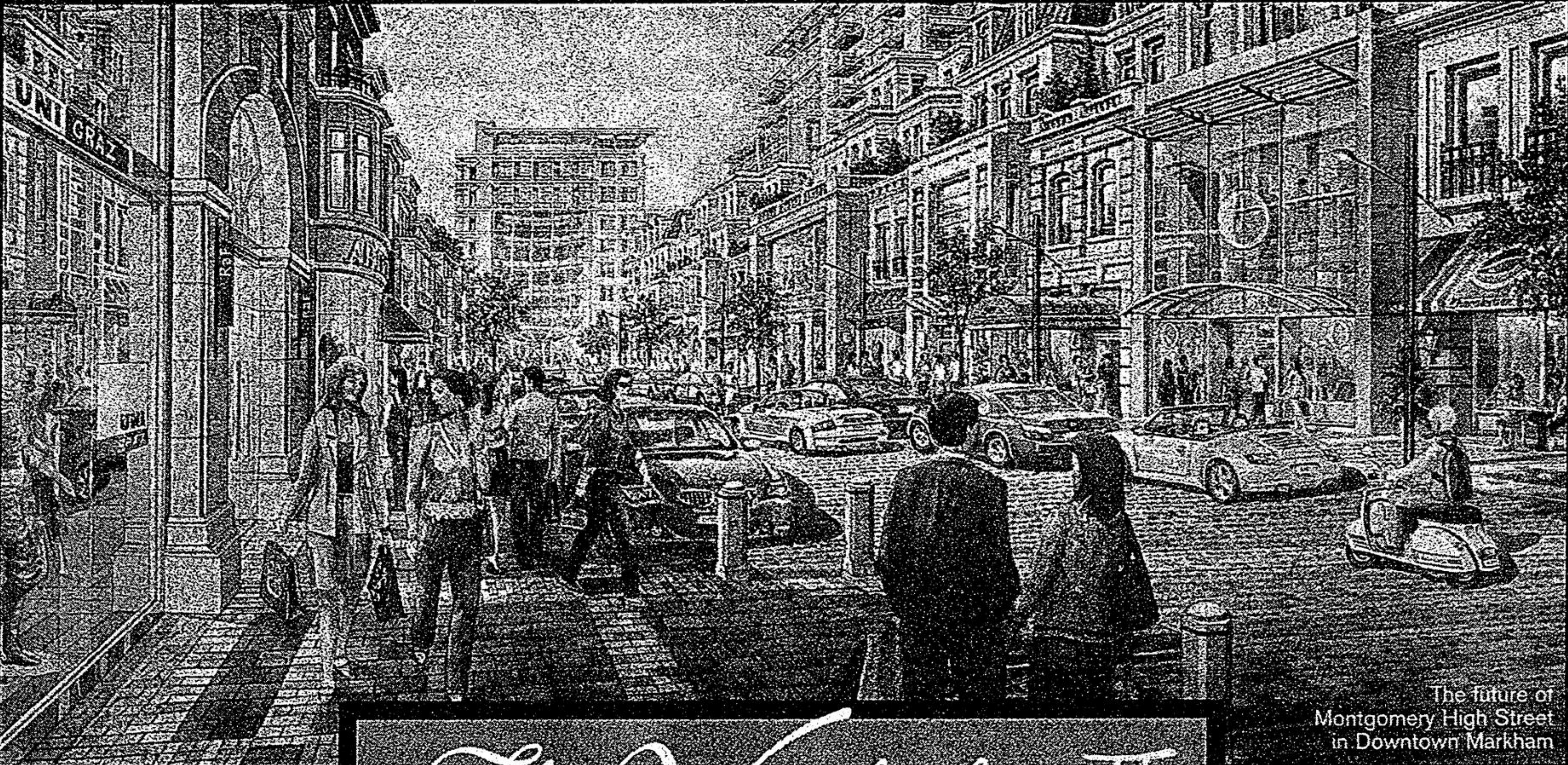
The future of Montgomery High Street in Downtown Markham