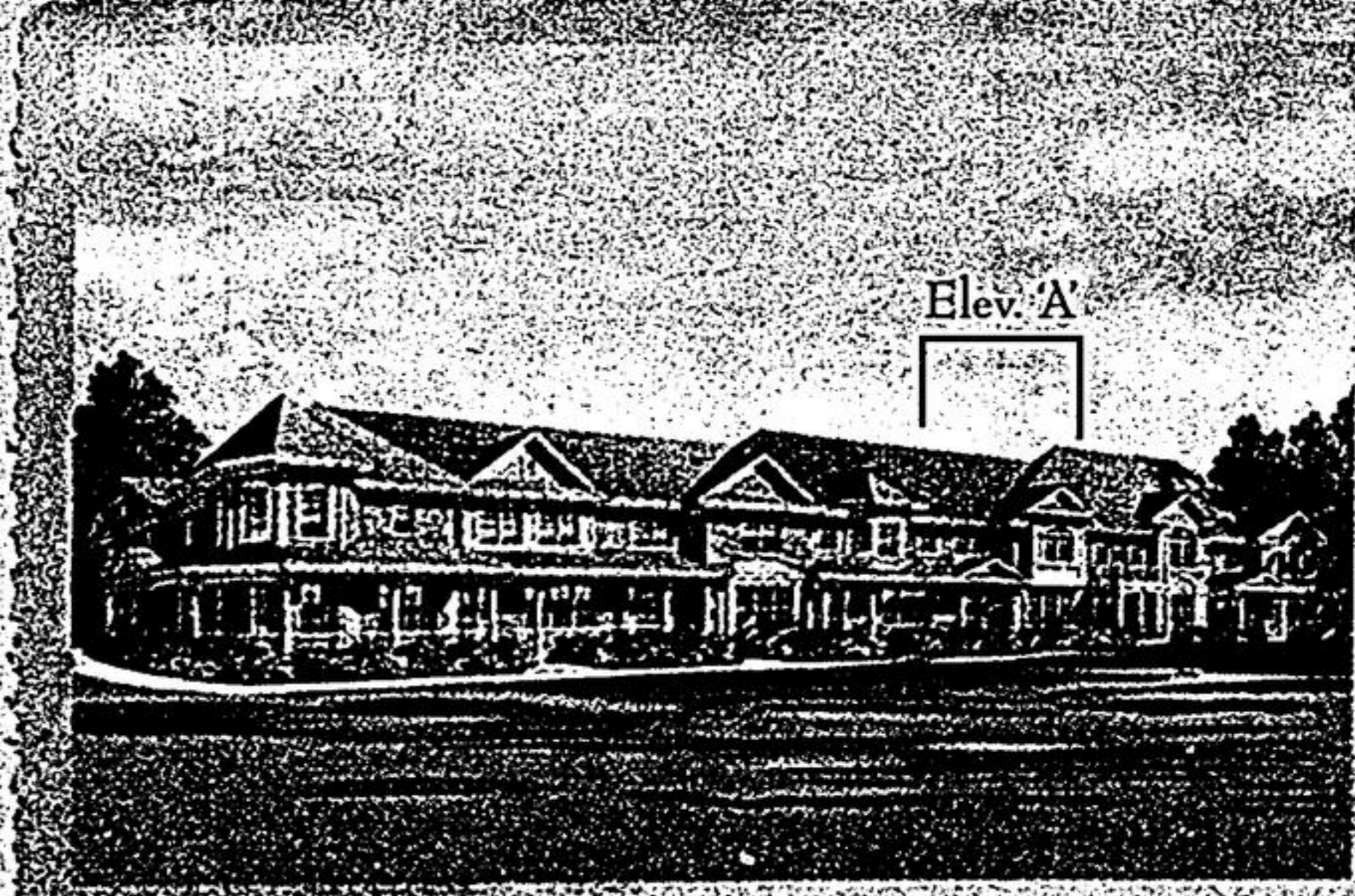
Townhome, The Haddon 'A', 1,475 Sq.Ft., $282,990