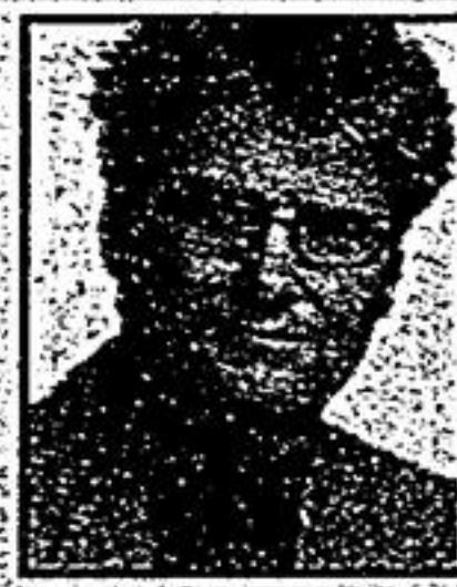
OLEH KOBYLECKY* www.classichomes.ca