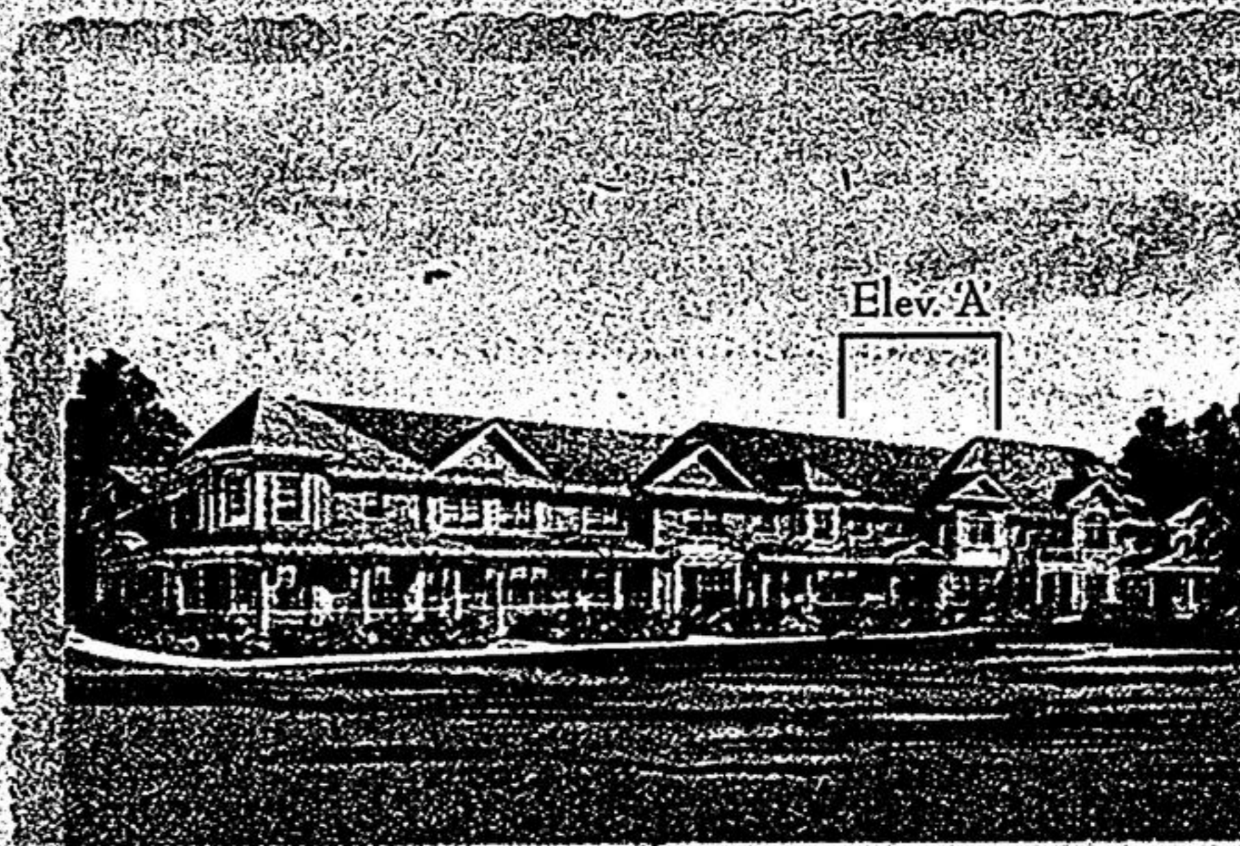
Townhome, The Haddon 'A', 1,475 Sq.Ft., $292,990