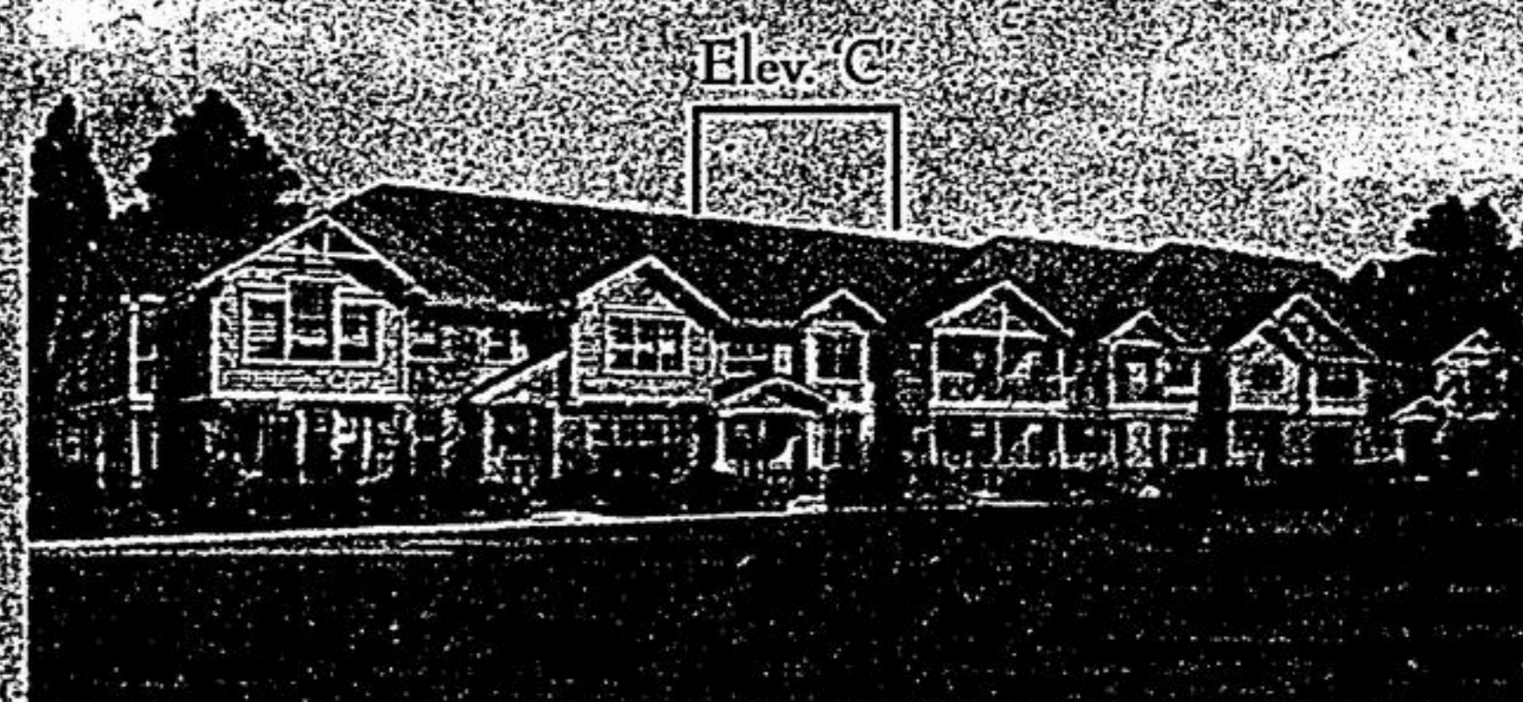
Townhome, The Chelsea 'C', 1,194 Sq.Ft., $269,990