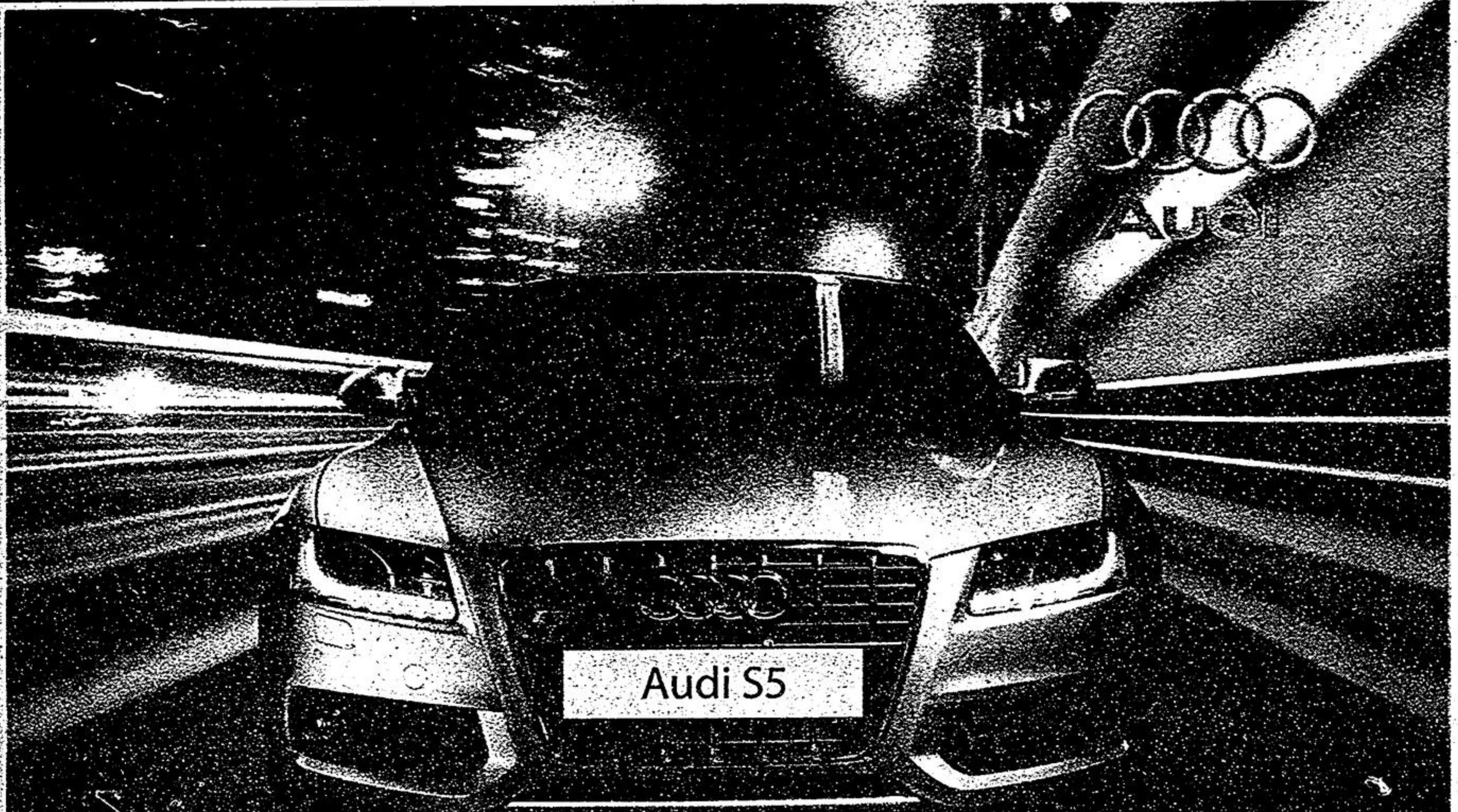
Audi Uptown Markham Downtown Fine Cars Inc.

For more information on fire safety week and smoke alarms, call 905-640-9595.