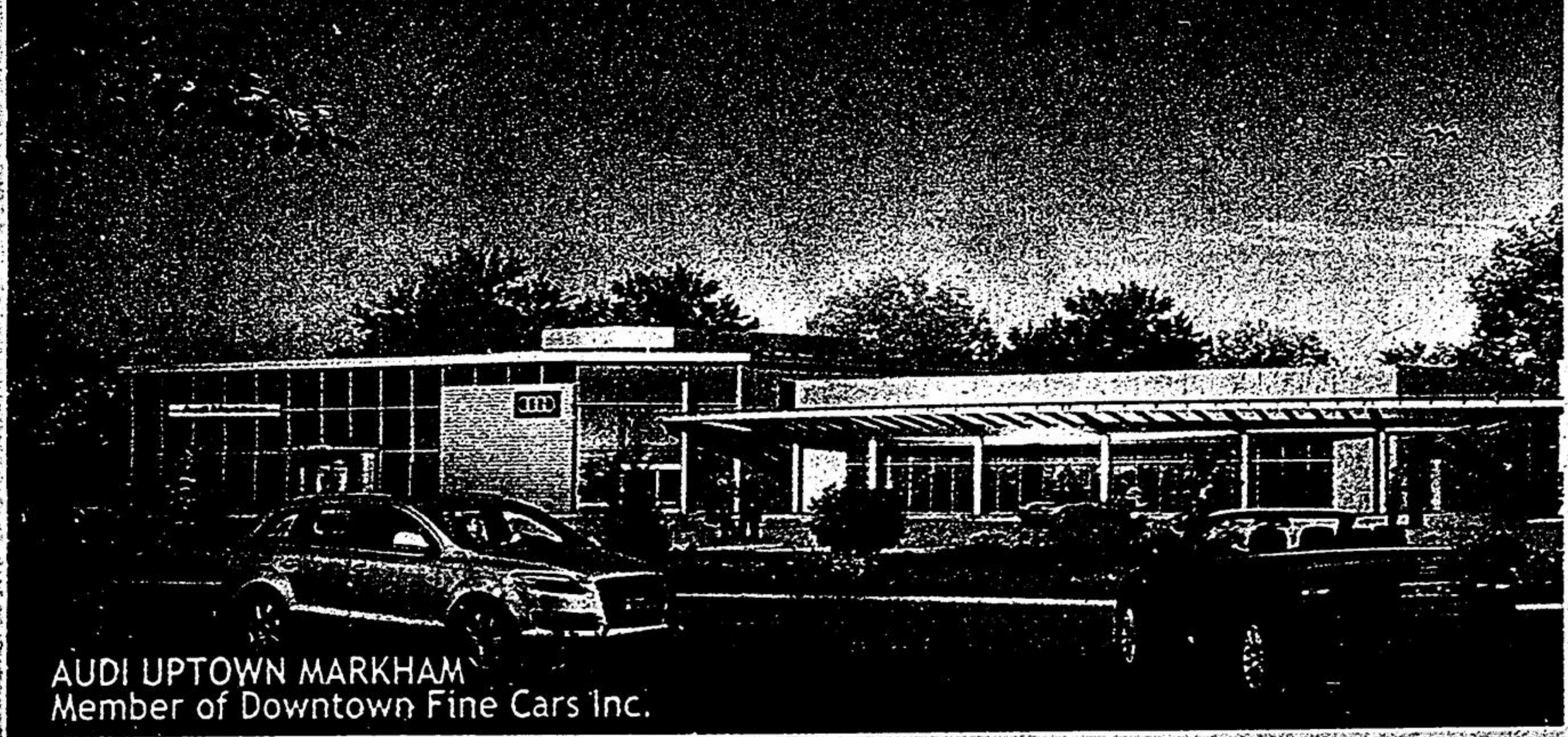
AUDI UPTOWN MARKHAM Member of Downtown Fine Cars Inc.