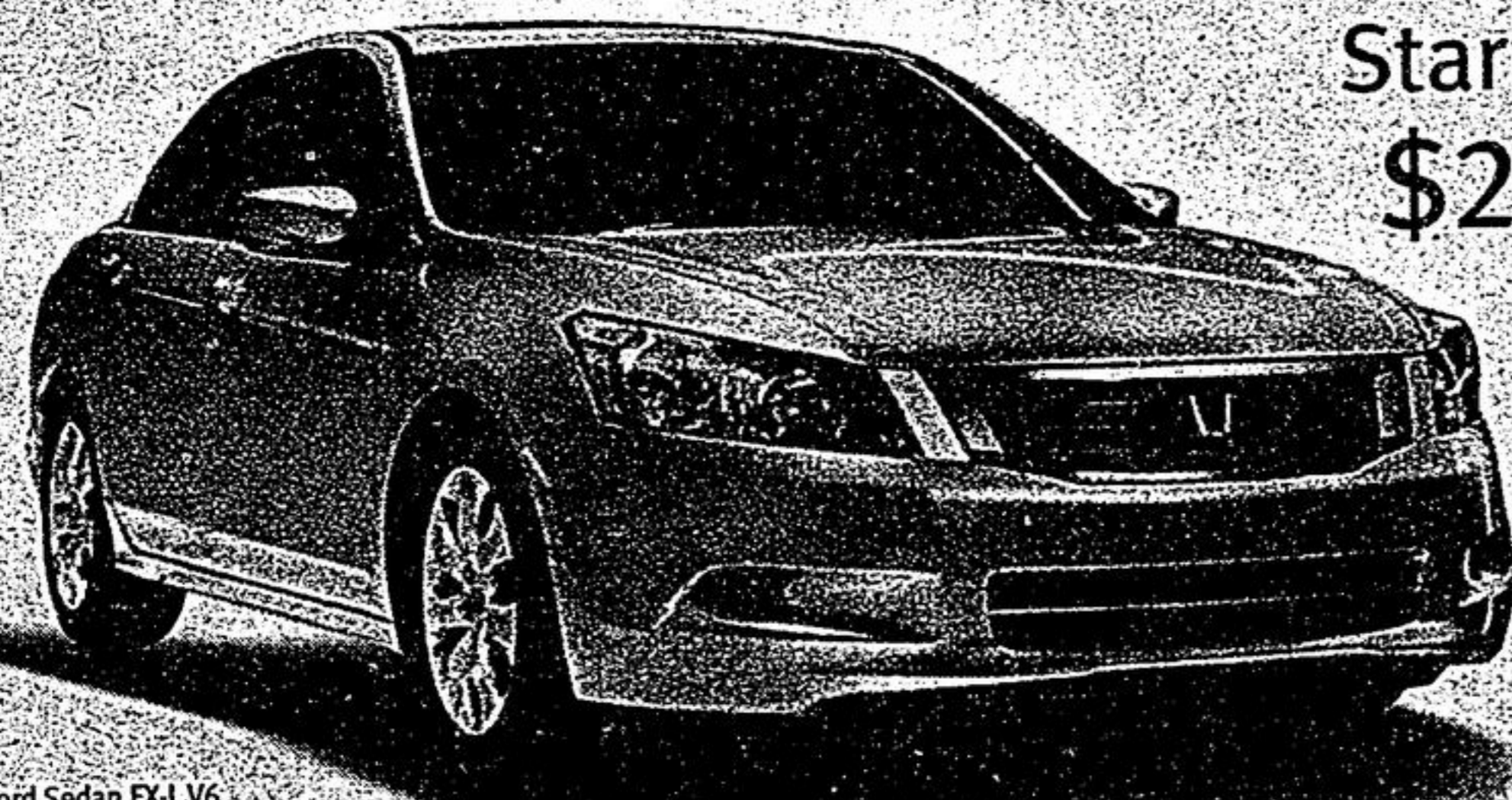
Accord Sedan EX-L V6 model CP3688JN $34,990 MSRP