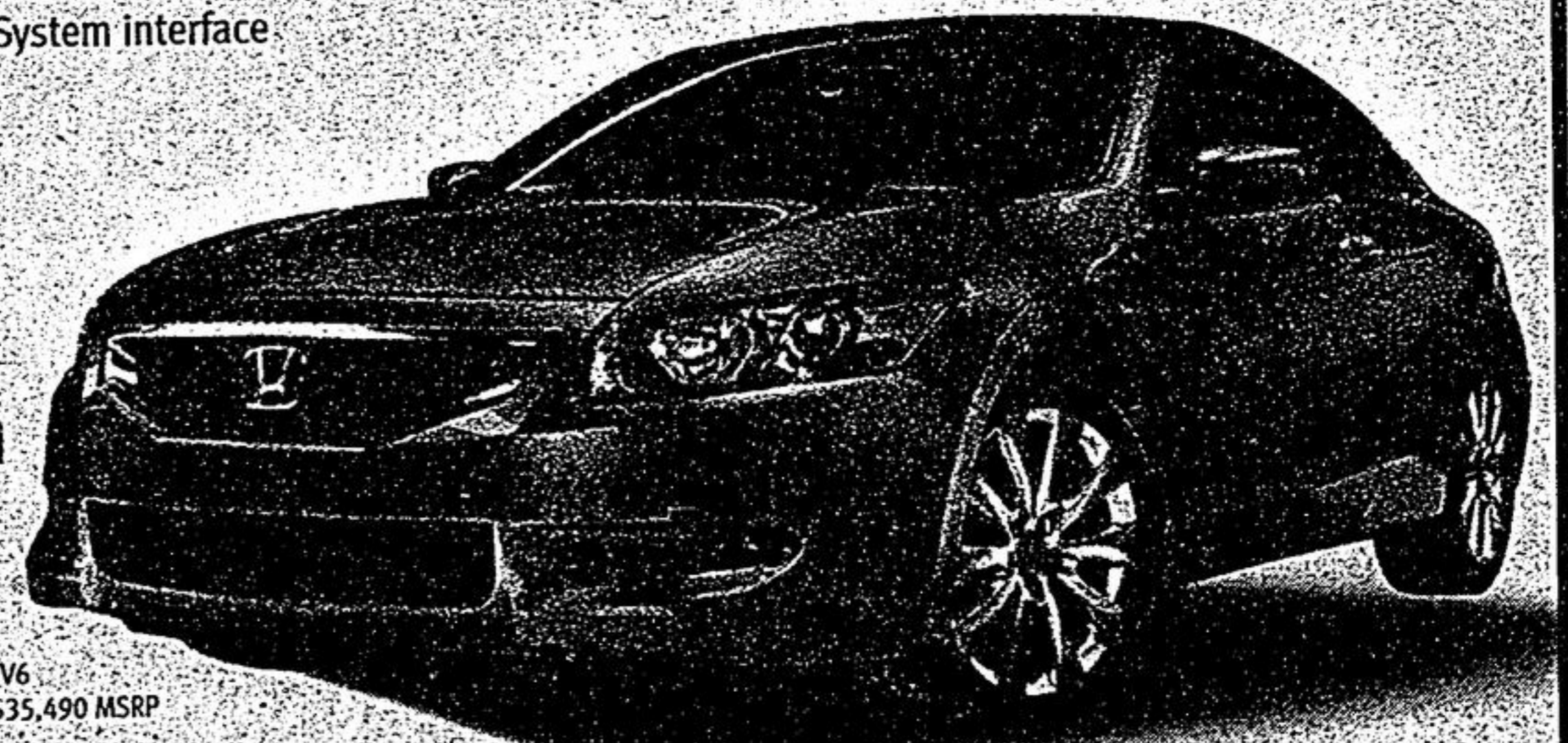
Accord Coupe EX-L V6 model CS2188JN $35,490 MSRP