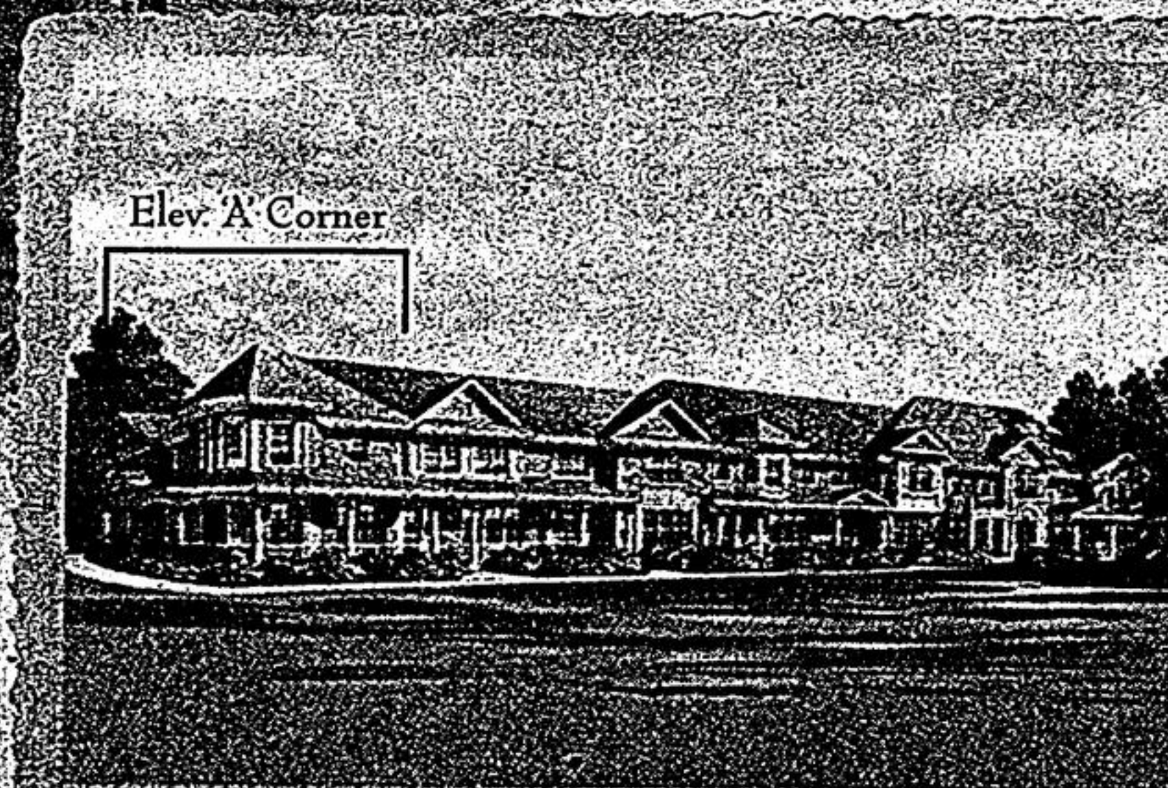
Townhome, The Queensdale Corner 'A', 1,887 Sq.Ft.