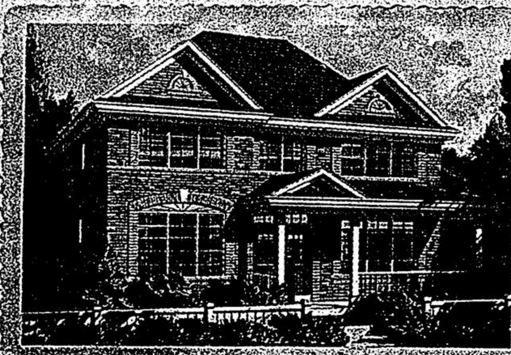
36' Home, The Bentleigh 'B', 2,100 Sq.Ft., With Attached Garage