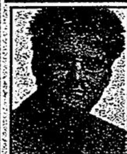
OLEH KOBYLECKY www.classichomes.ca