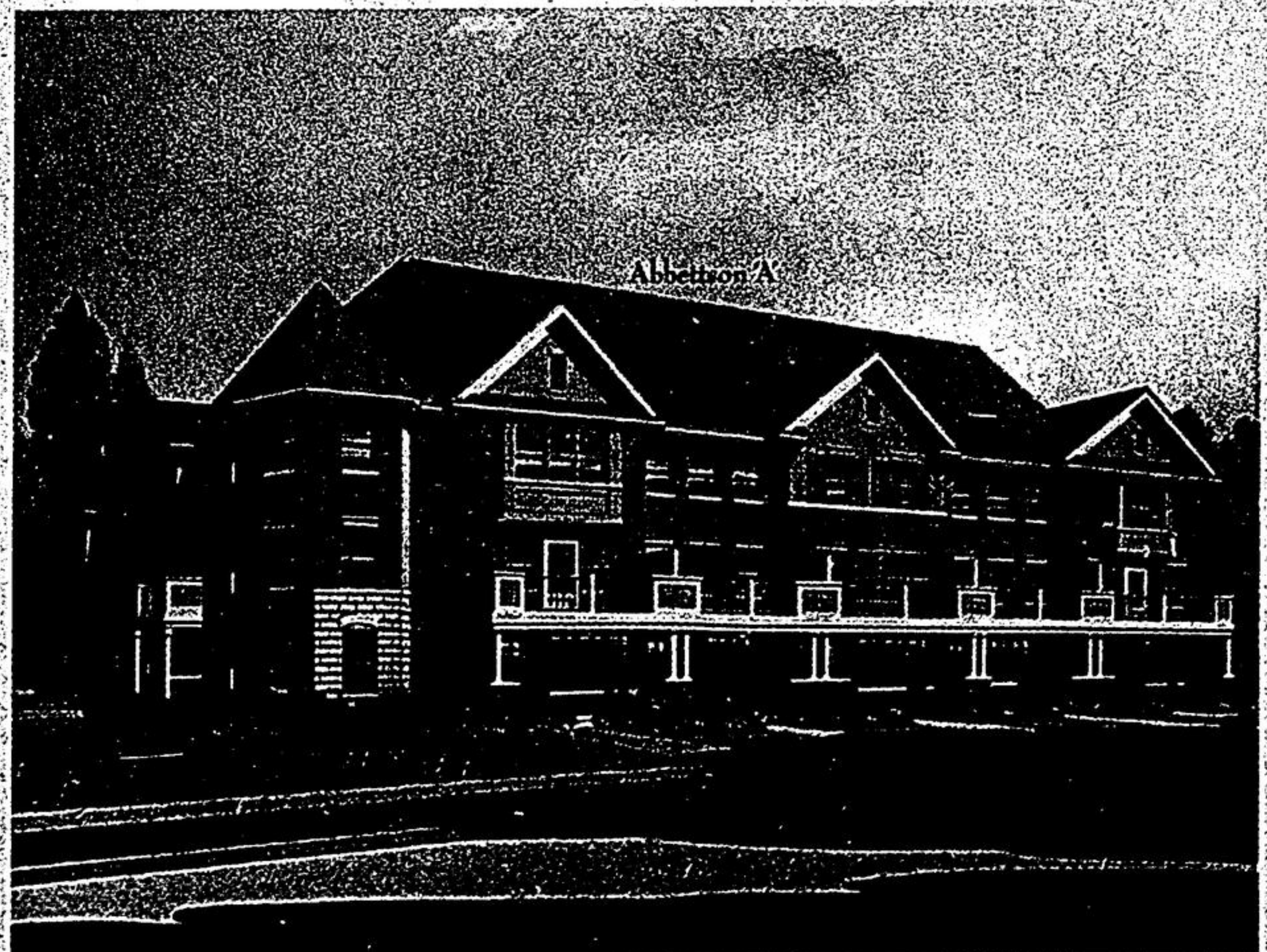
A popular Condo Village Town design at Summerside is the 1,095 sq. ft. Abbotson (Elevation A)

For an overview of Mattamy's communities, visit www.mattamyhomes.com