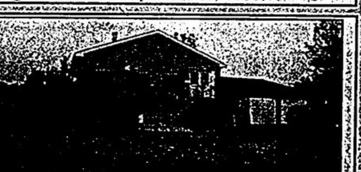
BEAUTIFUL 30 ACRES