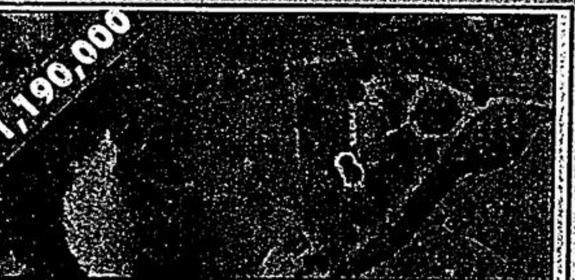
22 AC ESTATE ONLY 5 MINUTES TO 407

Excellent opportunity to own and expand a successful venture with 29 acres zoned to allow for additional facilities - build a retreat! Call Bryan Armstrong* 905-940-4180.