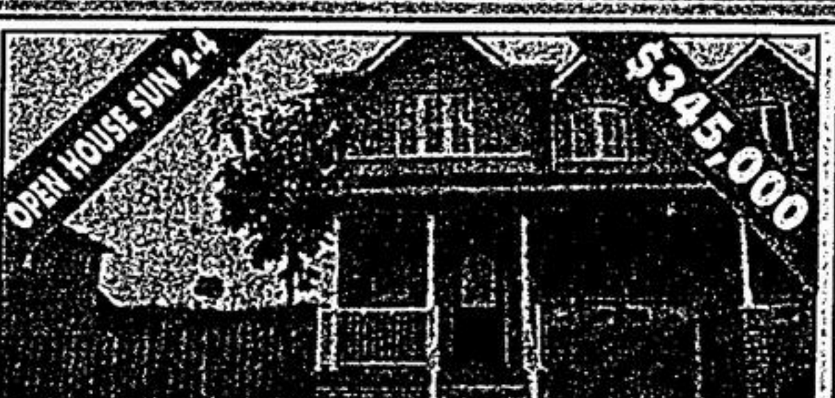
593 CABOTO TRAIL, SOUTH UNIONVILLE