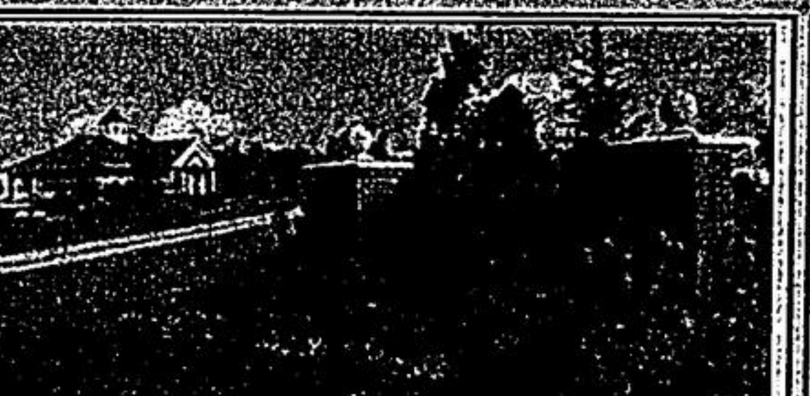
BALLANTRAE GOLF & COUNTRY CLUB

Best value semi-detached, hardwood floor, open concept, separate living, dining & family rm, 3 bedrooms & 3 washrooms, extra large master bdrm w/his/hers closet & dresser niche, direct access to garage, extra green space at the side. www.markhamfinhomes.com Call Keith Wong*, 905-940-4180.