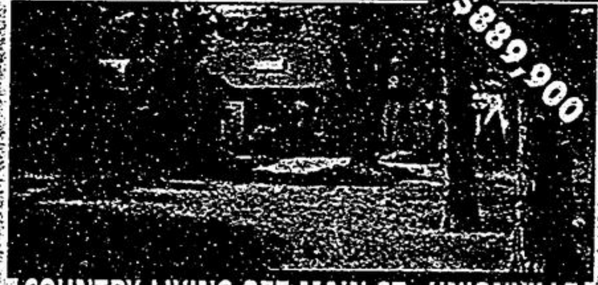
COUNTRY LIVING OFF MAIN ST., UNIONVILLE

Five month new darling freehold townhome located in desirable South Unionville off Kennedy Road. All conveniences minutes away. Fabulous home faces a Park. Attached single garage, hardwood floors, finished basement make this a great choice! Call Anne Cairns* to view, 905-940-4180.