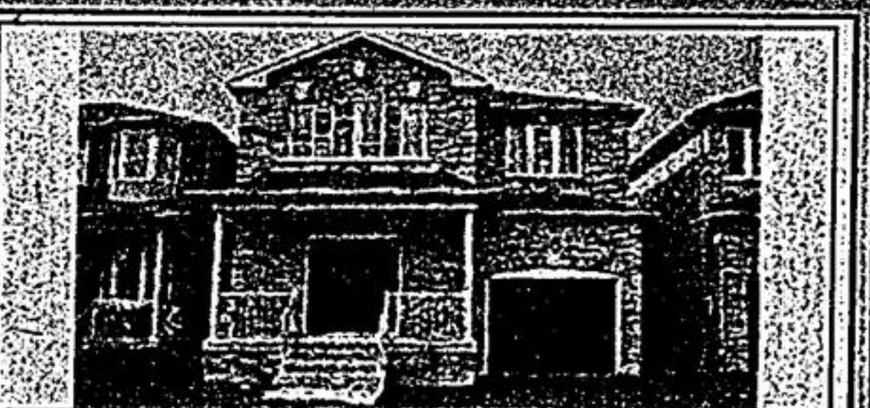
109 A HERON ST., AJAX

Fully paddocked & private w/stunning views. Manicured lawns w/walking trails through 5 acres of bush. Overlooking forest, enormous pond/lake, stream & conservation. Open concept 4 bdrm bungalow w/lrg modern kit, exposed brick, 2 car gar & entertaining wrap around deck. Long paved drive circling by house, barn & workshop w/pkg for 50 of your closest friends. Start horsing around & call me! Robert Alos*, 905-940-4180. 4695 Westney Rd.