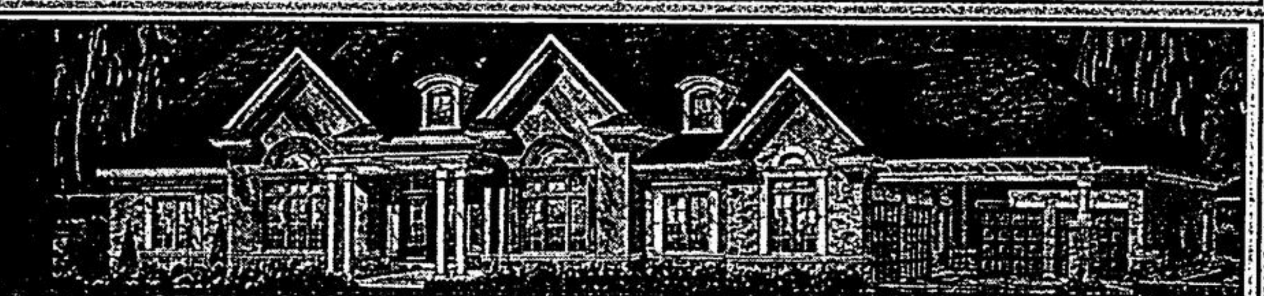
OPEN HOUSE SAT & SUN 1-4 ~ RIDGE RD. ~ "GOODWOOD"

Castle Pines Model - Luxury Edition. With finished lower level! Premium corner lot. For your private viewing please call Inge Schickedanz* 905-940-4180.