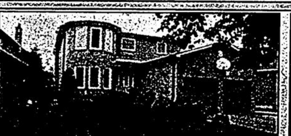
QUIET CRESCENT WITH LOCAL TRAFFIC

Immaculate home located in desirable Ballantrae Golf & Country Club, Pinehurst model. Approx 1700 sq. ft. Open concept West exposure. For more details, 905-940-4180.