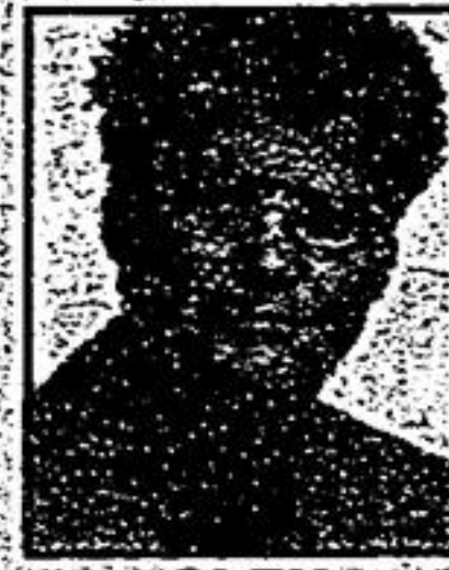
OLEH KOBYLECKY* www.classichomes.ca