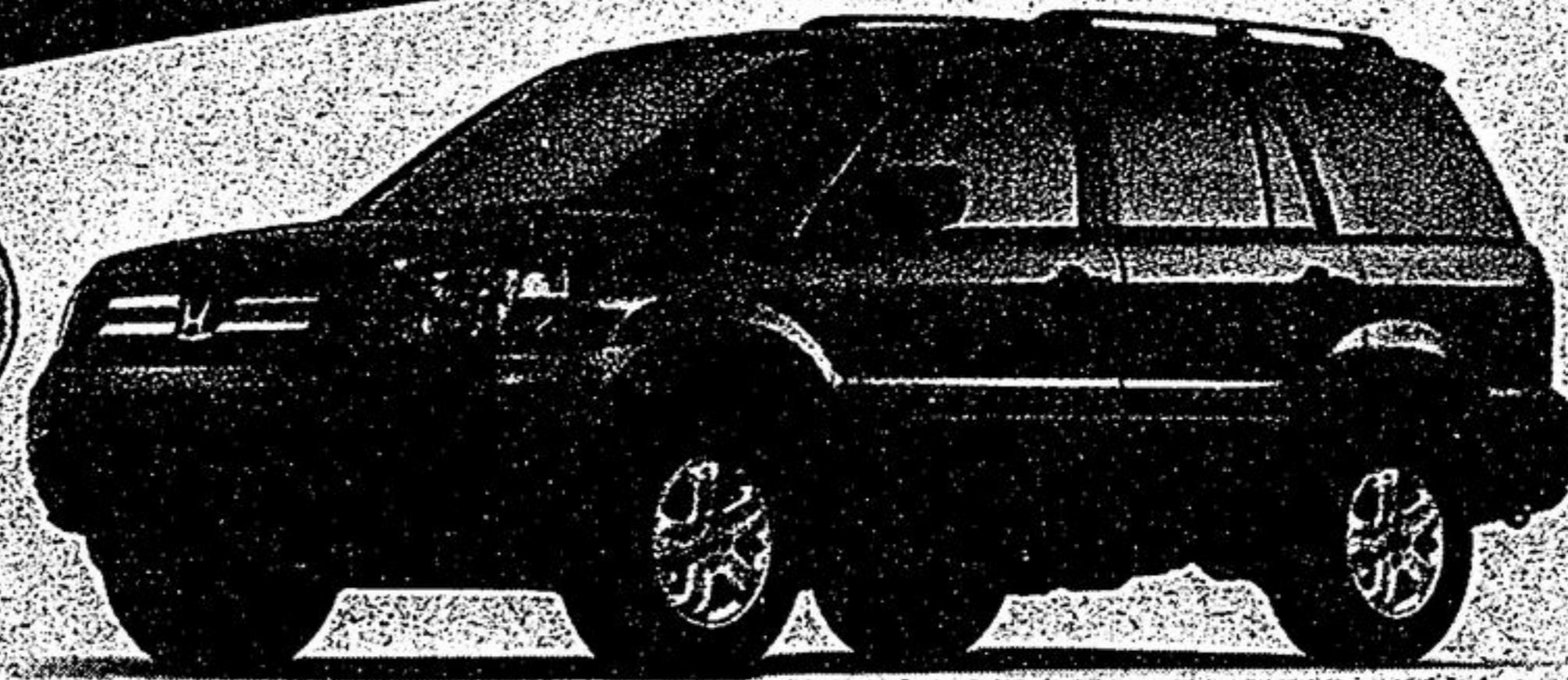
Pilot LX 7WD model V72817EX