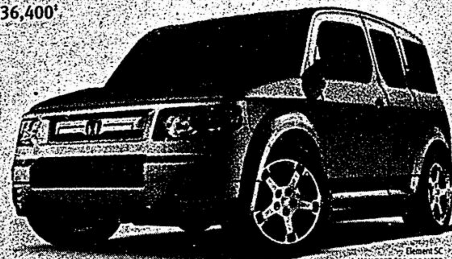
Element SC model V11797E $39,900 MSRP

Pilot room, power and fuel efficiency are ideal for the family on the go. Pilot holds a full load of your friends, your gear and delivers peace of mind as an IIHS '2007 Top Safety Pick'. Starting from $36,400*