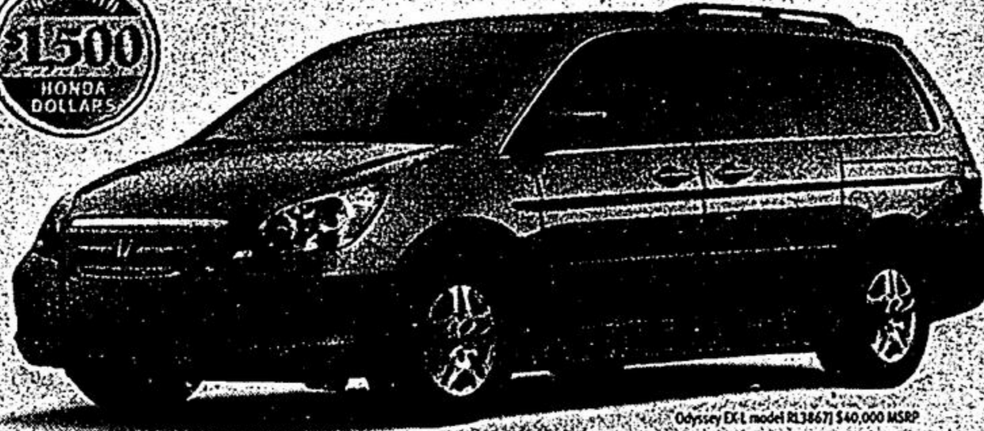
Odyssey EX-L model R13671 $40,000 MSRP