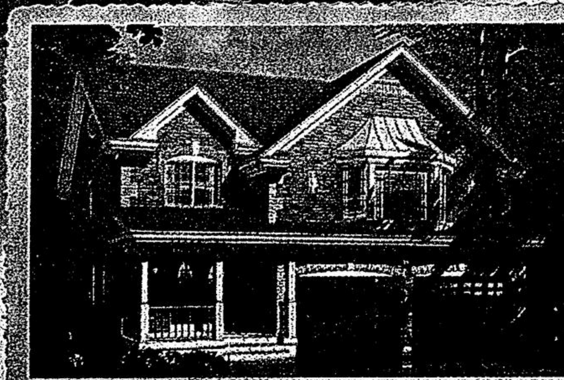
36' WideLot™, The Laketon B, 1,945 Sq.Ft., $349,990