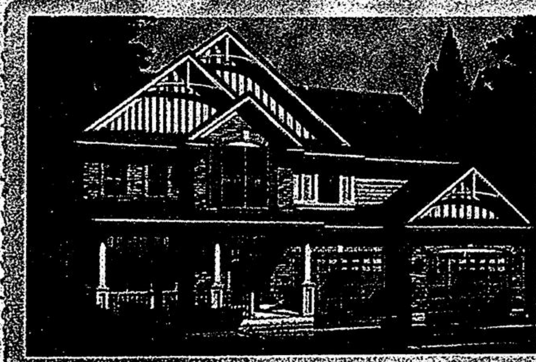
45' WideLot™, The Farnham A, 2,595 Sq.Ft., $417,990