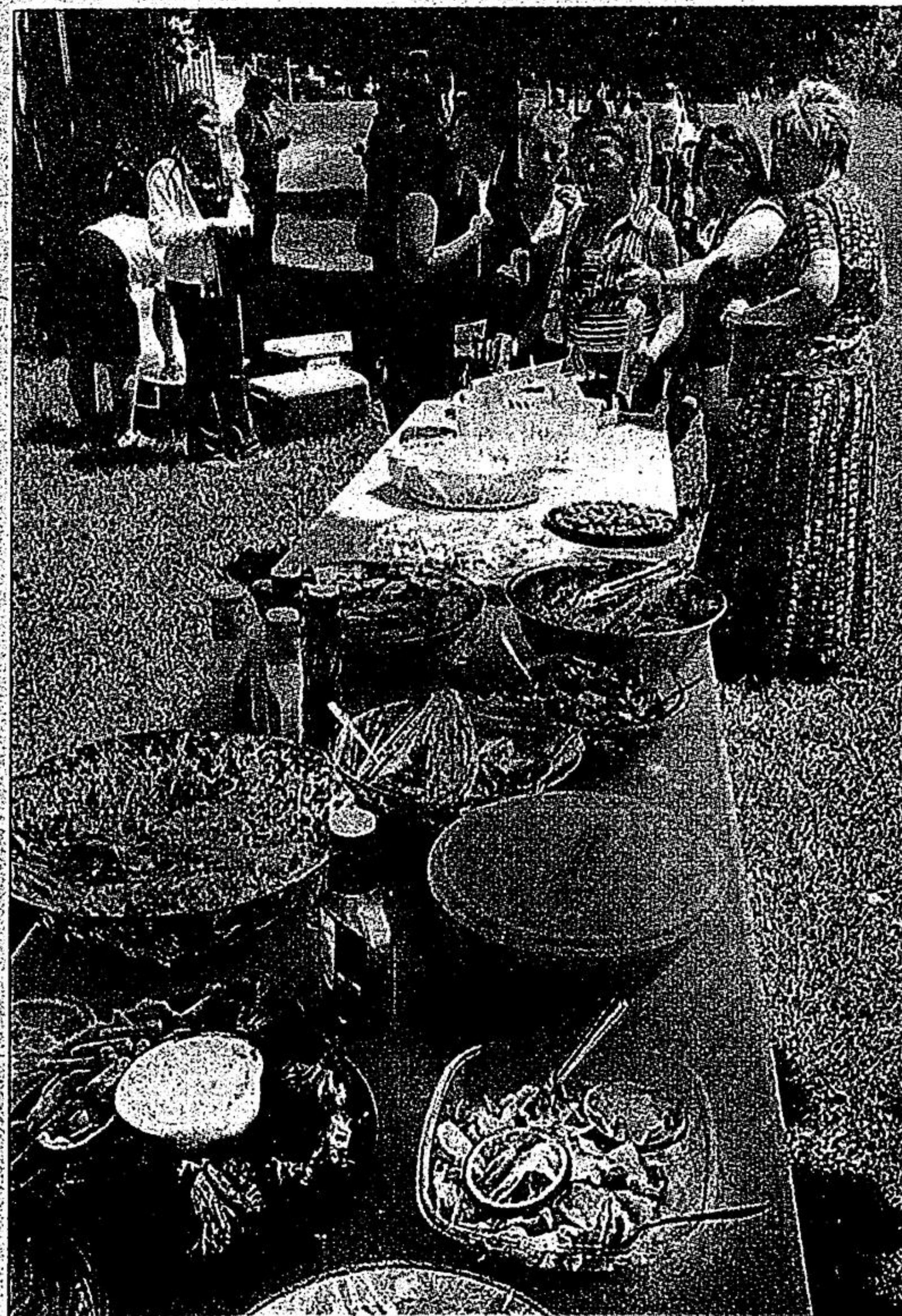
The buffet table awaits students, parents and staff members.