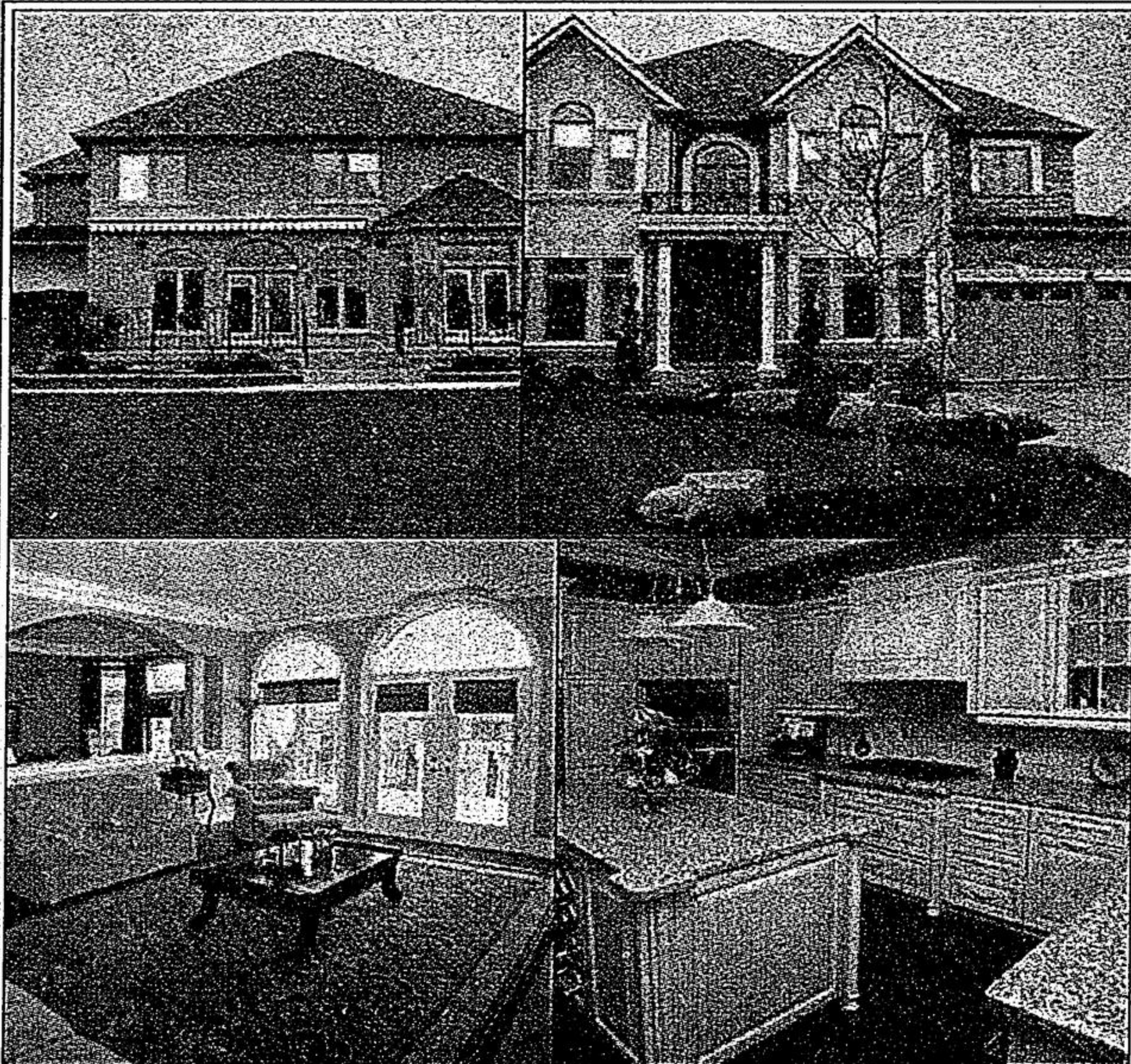
ANGUS GLEN - A "10" - $1,298,000

MOVE UP TO THESE HOMES AND "SYLVIA HOUGHTON" WILL BUY YOUR HOME FOR CASH