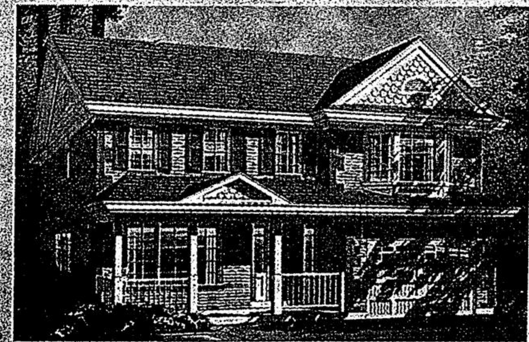
36' WideLot™, The Alyson-D, 1,648 Sq.Ft., $329,990