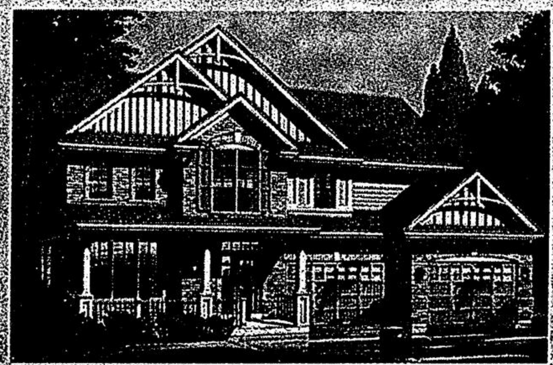
45' WideLot™, The Farnham A, 2,595 Sq.Ft., $417,990