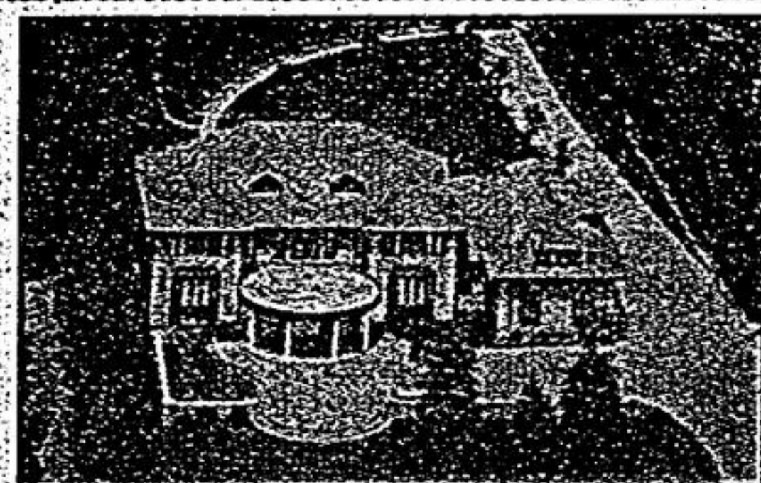
19 Cachet Parkway List $1,875,000