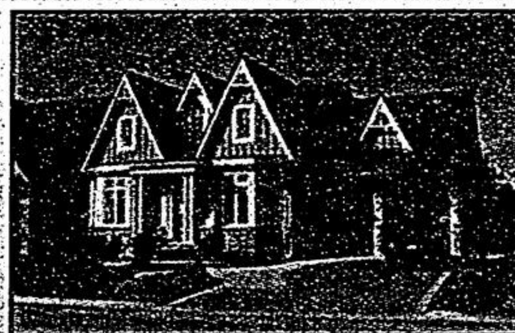
14 Harper Hills Road List $1,099,00