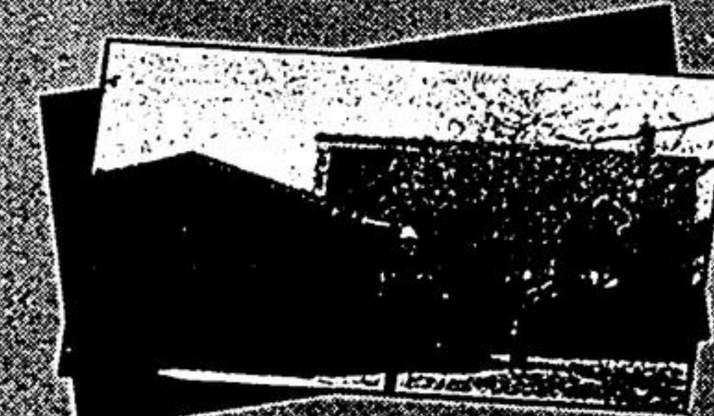
37 Henry Corson Place