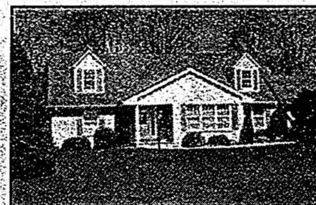
21 Bowes Lyon List $939,000