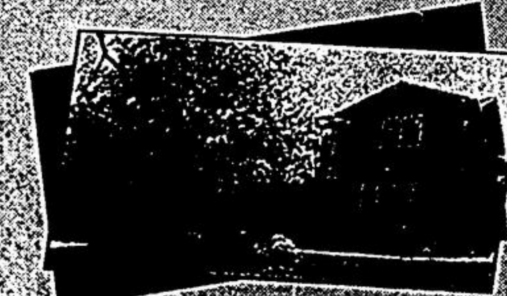
25 Fry Court