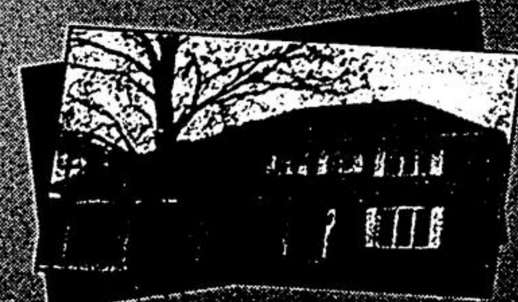
81 Red Cross