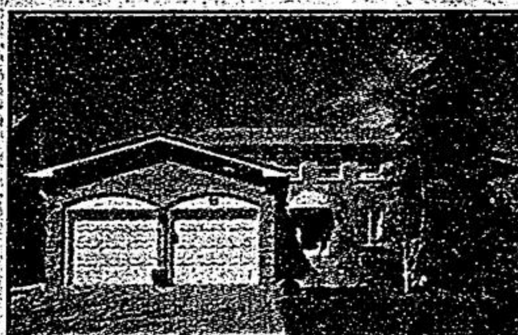
53 Ferndell Circle List $648,900