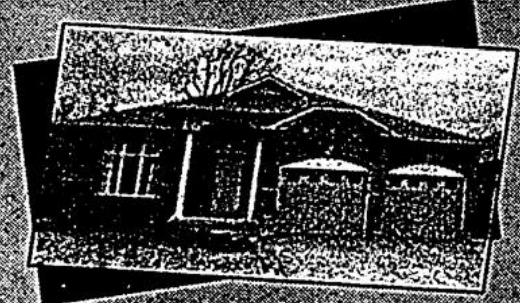
42 Bobby Locke Lane