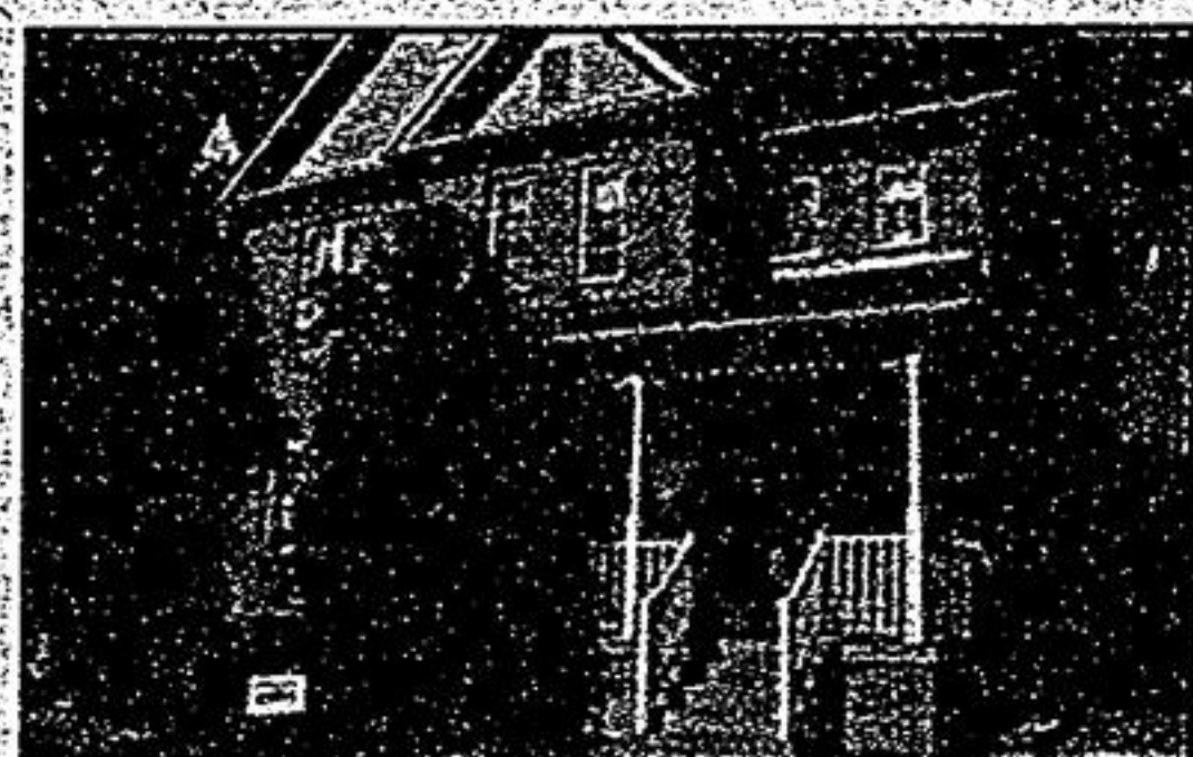
63 Dancer's Drive List $469,900