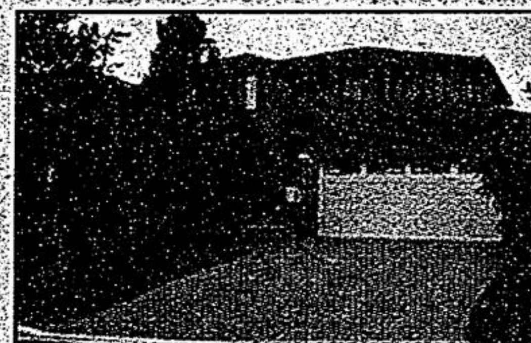
46 Eastwood Crescent List $459,000