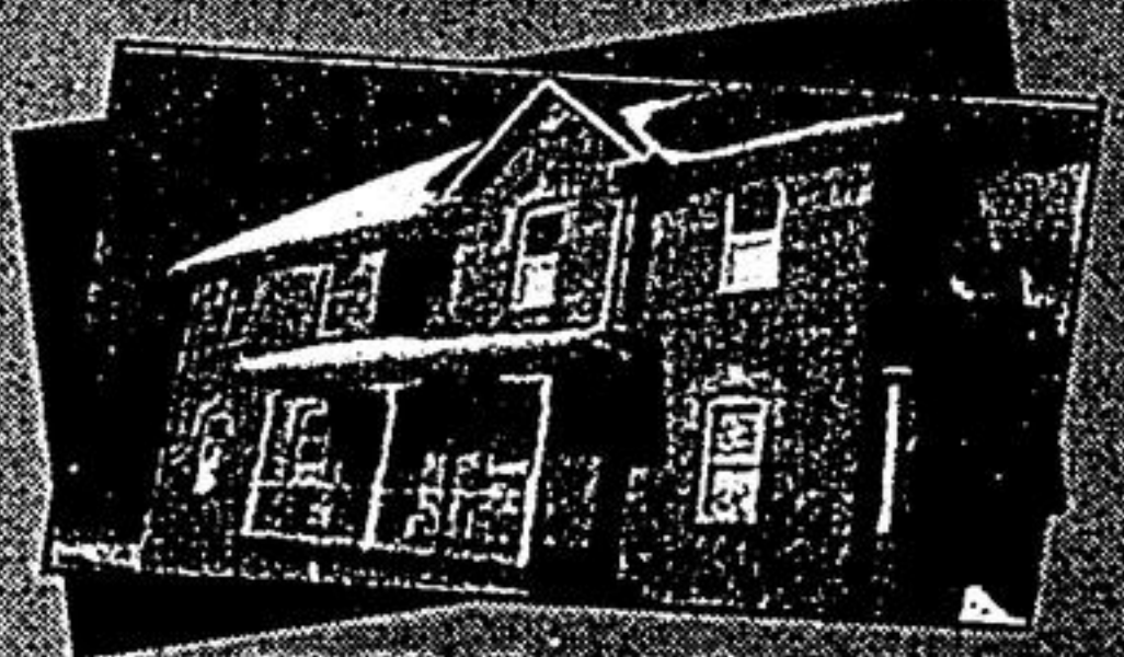
76 Melissa Court