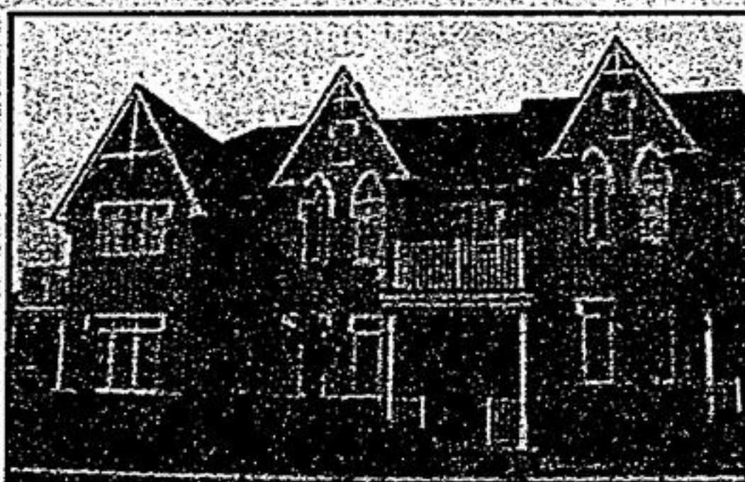
72 Dancer's Drive List $384,900