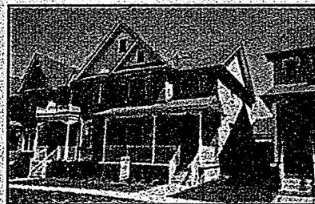
9 Colty Drive List $378,800

CALL IF YOU SEE A MOVE IN THE NEAR FUTURE!