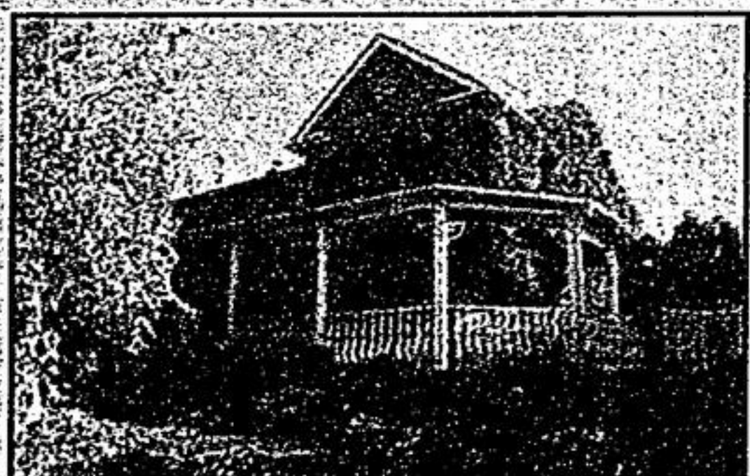
17 Grove Road List $449,900