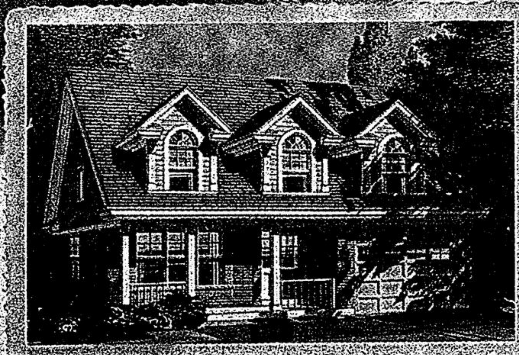
36' WideLot™, The Alyson A, 1,648 Sq.Ft., $324,990

Newmarket's highly distinctive family community presents a fully detached neighbourhood of 30', 36' and 45' WideLot™ homes, all featuring the many comfortable and cost-saving benefits of ENERGY STAR®.