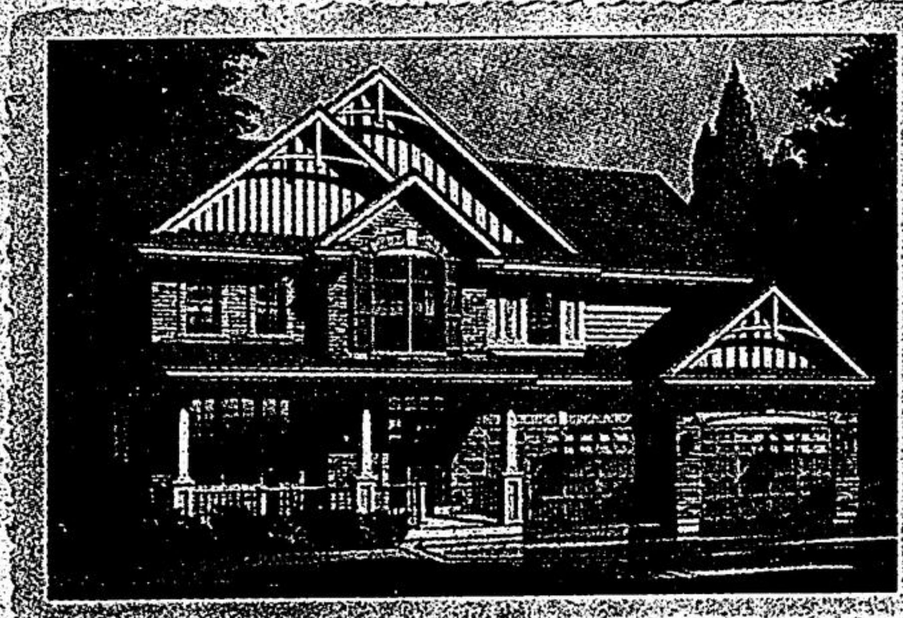
45' WideLot™, The Farnham A, 2,595 Sq.Ft., $417,990