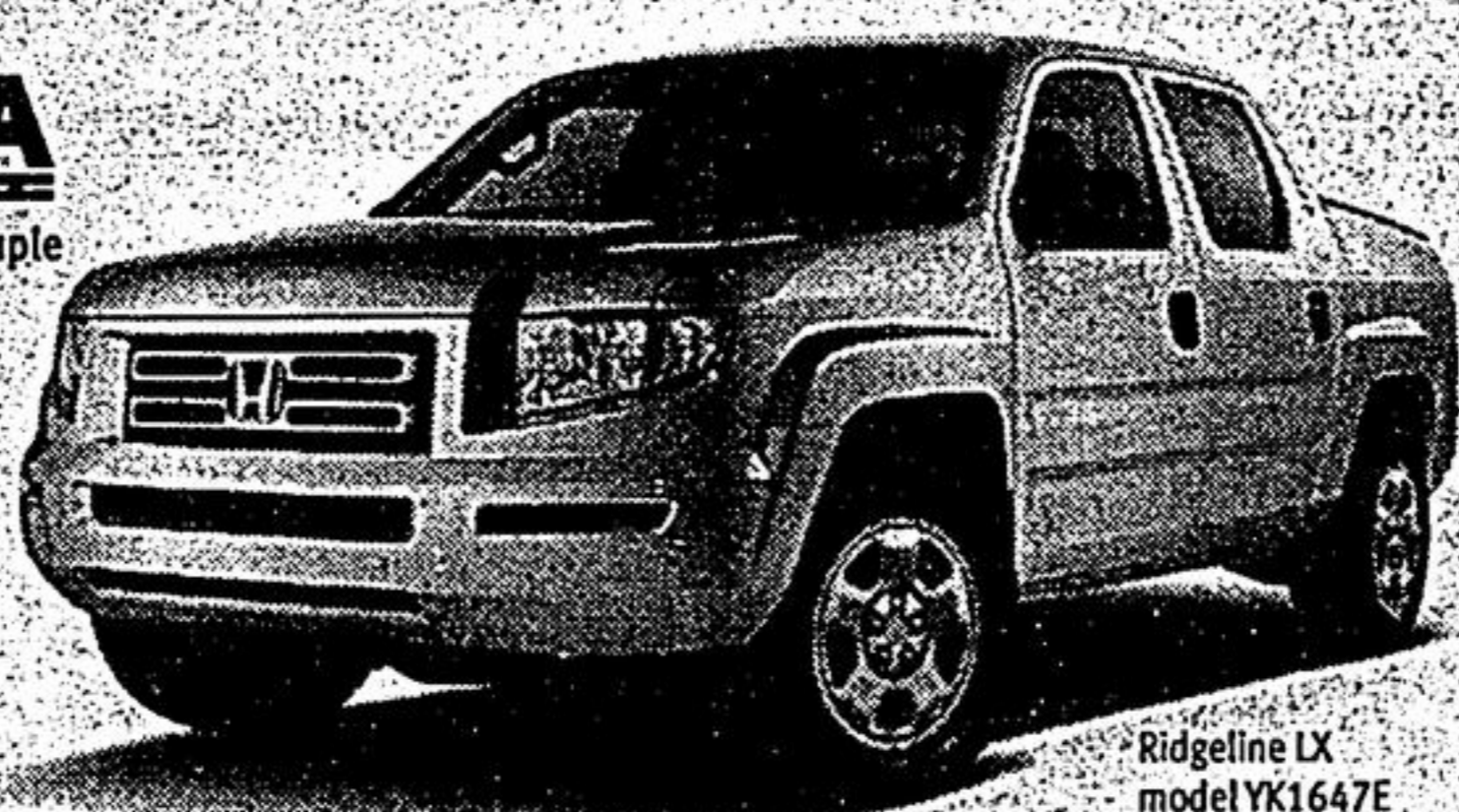
Ridgeline LX model YK1647E

***** NHTSA 2007 NHTSA Quadruple "5-Star rating"