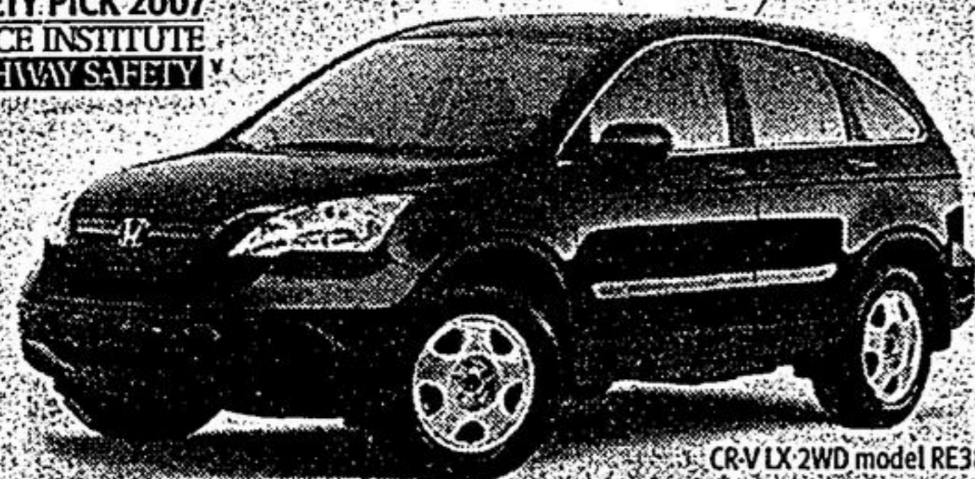
CR-V LX 2WD model RE3837E

TOP SAFETY PICK 2007 INSURANCE INSTITUTE FOR HIGHWAY SAFETY