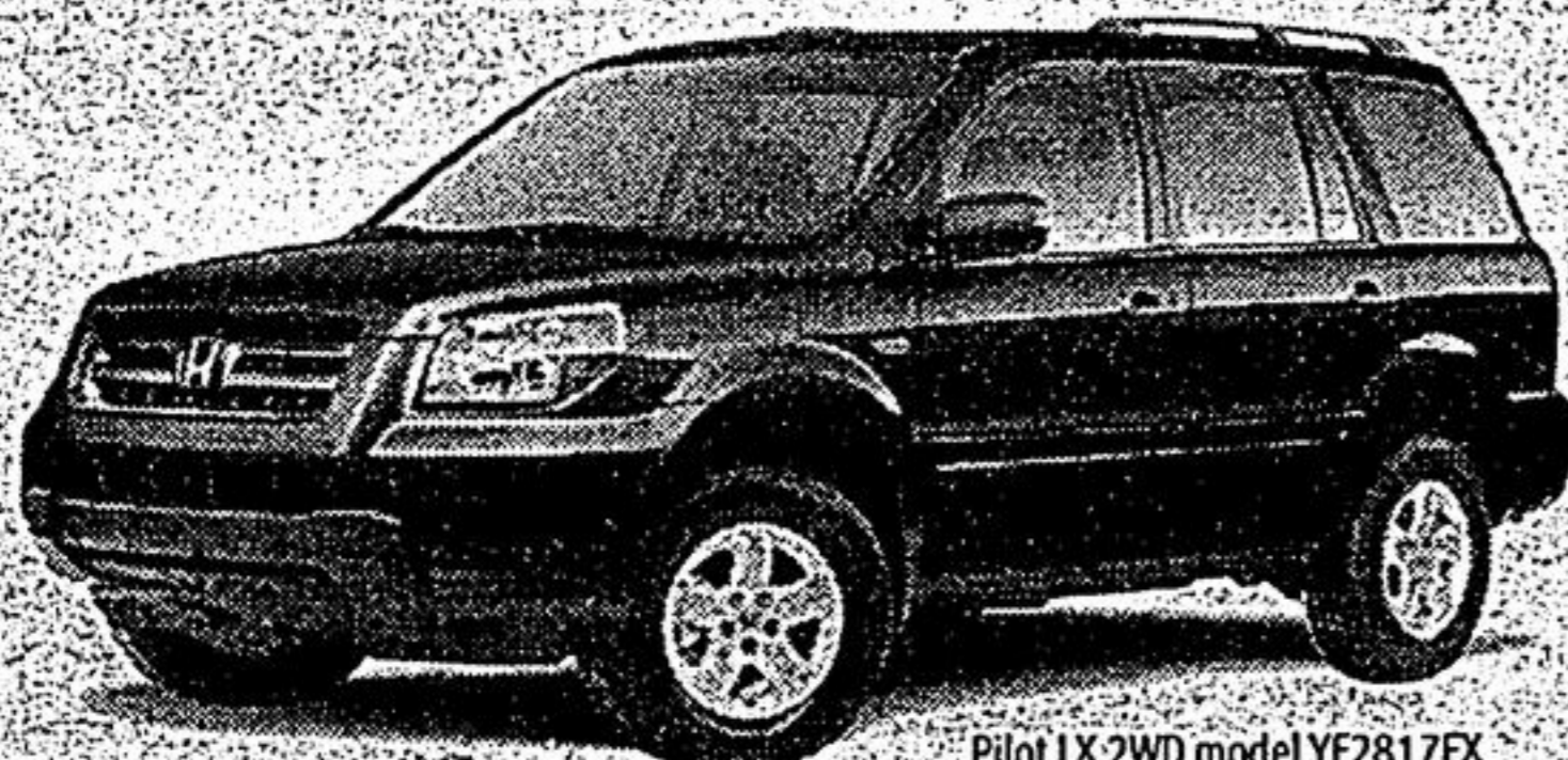
Pilot LX 2WD model YF2817EX

Car and Driver's "5Best" Trucks for 2007.