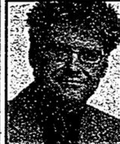
OLEH KOBYLECKY* www.classichomes.ca