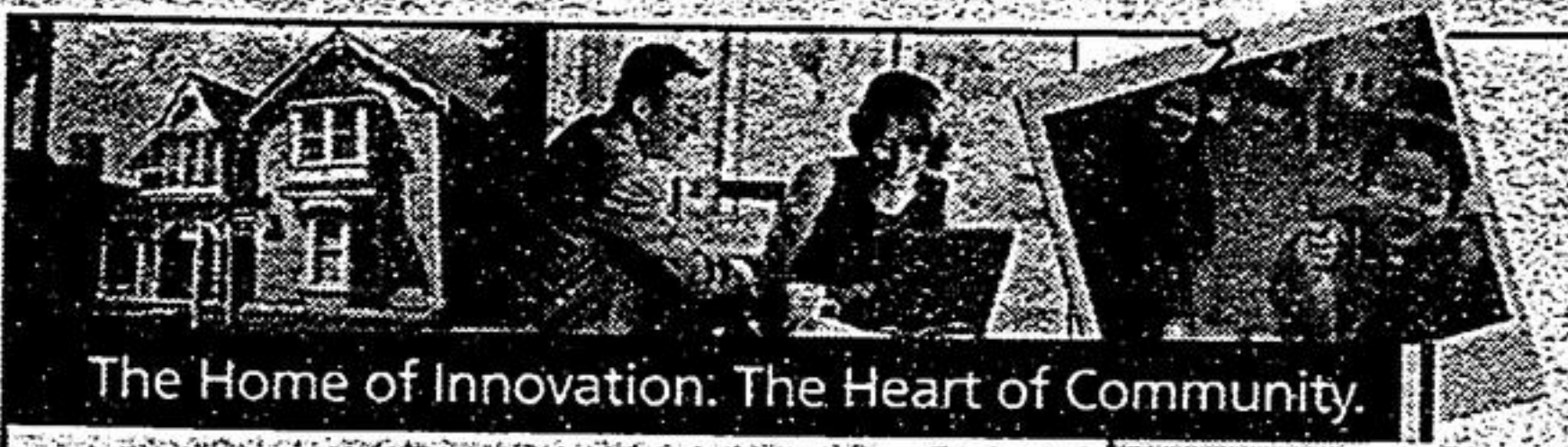
The Home of Innovation. The Heart of Community.

A unique blend of four thriving communities – Markham, Unionville, Milliken and Thornhill – the Town of Markham is a distinct and vibrant locale, the largest of nine communities in York Region and Canada's high-tech capital. Not your typical government job, a career with the Town of Markham is packed with challenge, change and the opportunity to make a difference. We offer numerous employment prospects and a wide range of benefit and wellness programs in a stimulating and forward-thinking work environment.