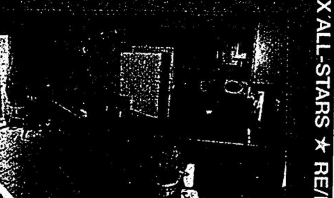
44 MIRAMAR ROAD