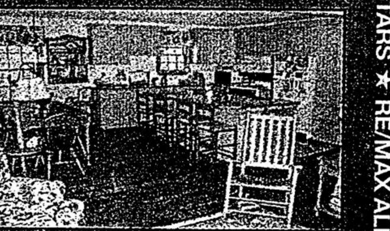
PRESENTING 17 UNION STREET