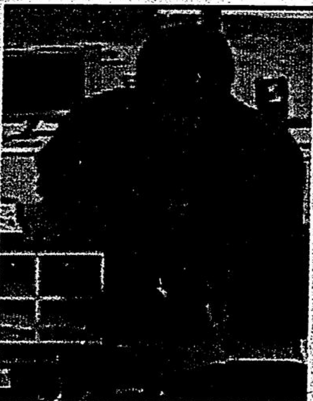
Suspect in third robbery in recent months at Stouffville's PACE Credit Union.