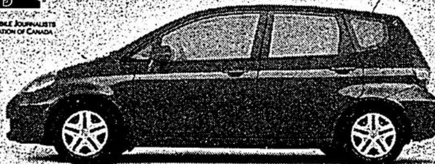
Fit DX model G03727E

2007 Best in Class Fuel Efficiency Winner*