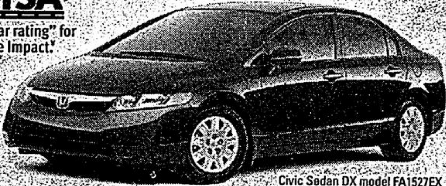
Civic Sedan DX model FA1527EX

2007 "5-Star rating" for Front & Side Impact*