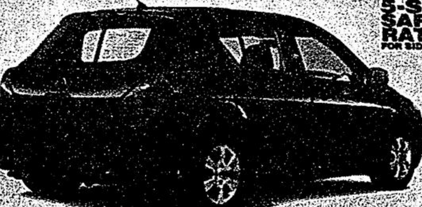
THE ALL-NEW 2007 NISSAN VERSA 1.8S M6 HATCH