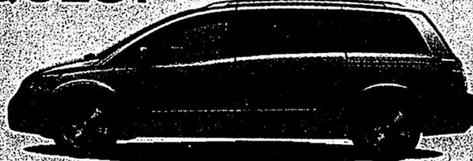
THE 2007 NISSAN QUEST 3.5 S