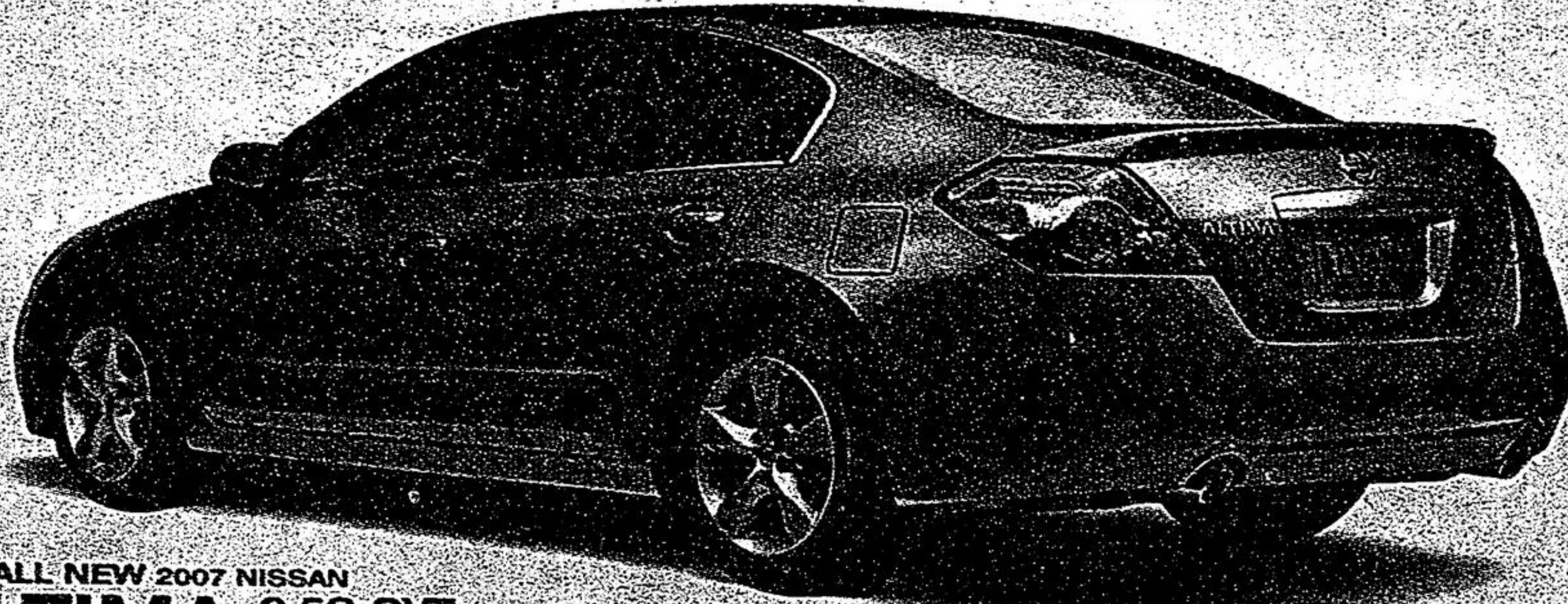
THE ALL NEW 2007 NISSAN ALTIMA 2.5S CVT