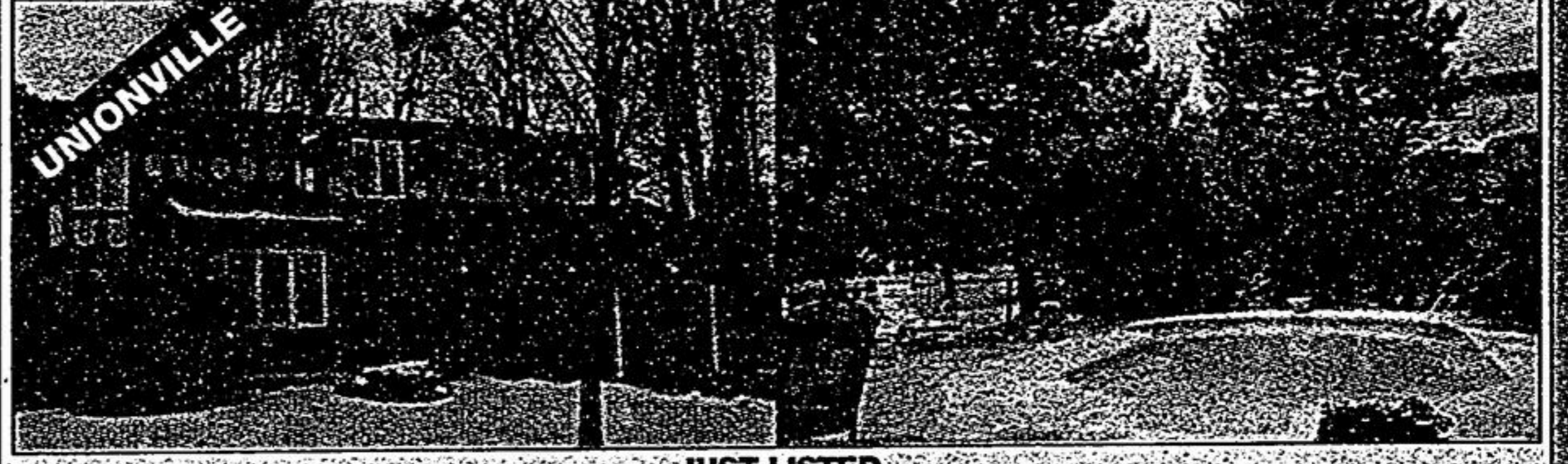
JUST LISTED $647,000

Fabulous executive home on a fabulous 70x125' treed lot with inground pool, siding to conservation and located on a court!! Features an outstanding 4 bedroom home, 2 ensuite, main floor library, family room & professionally finished basement.