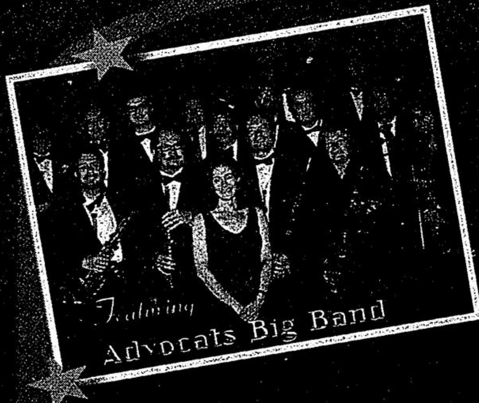
Featuring Advocats Big Band

Looking for a new car? Check out our Road Test Library. Click on yorkregion.com for the latest auto news and reviews.