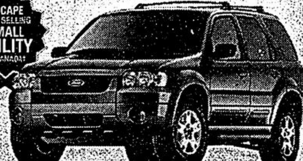
2007 ESCAPE XLT FWD WITH AUTOMATIC AND AIR

LEASE FOR $259 WITH 3.4% LEASE APR. OR PURCHASE WITH 0% 60 MONTH PURCHASE FINANCING ON MOST 2007 ESCAPE. PER MONTH/48 MONTHS WITH $3,299 DOWN PAYMENT OR EQUIVALENT TRADE. FREIGHT $1,250. $0 SECURITY DEPOSIT.