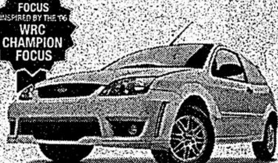
2007 FOCUS 3-DOOR GFX WITH 5-SPEED MANUAL AND AIR

OWN IT FOR $234 WITH $0 DOWN. OR PURCHASE WITH 0% 72 MONTH PURCHASE FINANCING. PER MONTH FREIGHT $1,100.