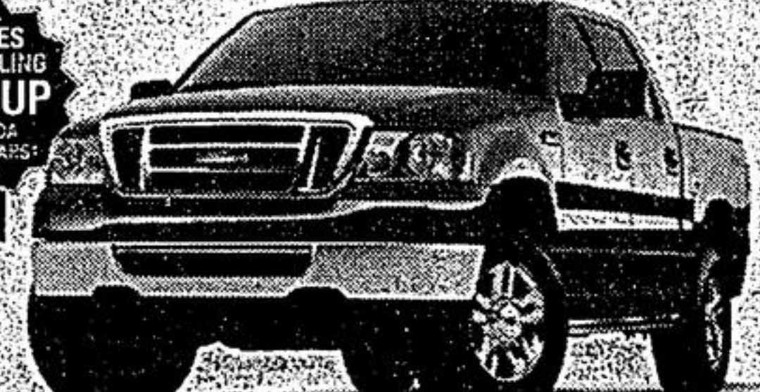
2007 F-150 SUPER CREW 4X4 WITH XTR PACKAGE

LEASE FOR $369 WITH 1.0% LEASE APR. OR PURCHASE WITH 0% 36 MONTH PURCHASE FINANCING ON MOST 2007 F-150. PER MONTH/36 MONTHS WITH $3,699 DOWN PAYMENT OR EQUIVALENT TRADE. FREIGHT $1,250. $0 SECURITY DEPOSIT.