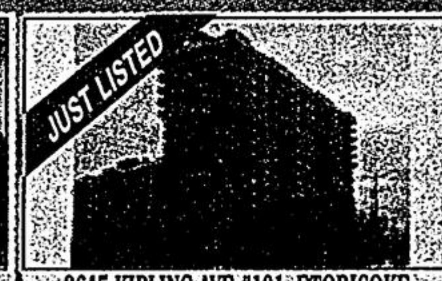
2645 KIPLING AVE #101, ETOBICOKE (FINCH & ALBION) Lovely 2 bdrm unit on 1st flr, completely renov'd, freshly painted, upgr'd bath, 1 pkg, fabulous location; walk to all amens. $127,000.