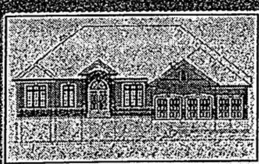
LOT 3 CAIRO CRT, STOUFFVILLE (BLOOMINGTON/10TH LINE) Chivatti custom built, bungalow, approx 1.5 acres, approx 2,800 sq. ft. $849,900.