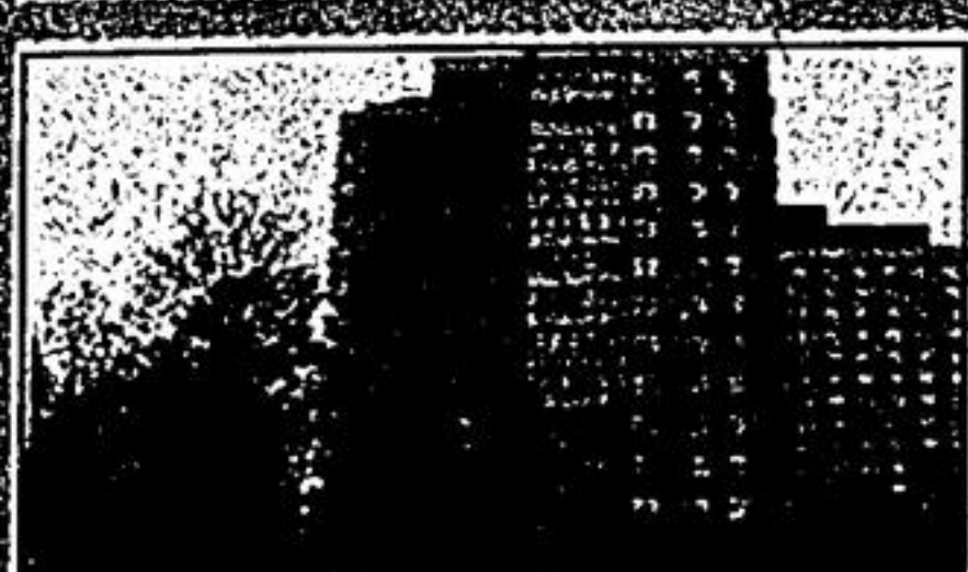
1275 MARKHAM RD #402, TORONTO (MARKHAM/SHEPPARD) Renovated, very lrg unit, approx 1400 sq. ft. w/lrg balcony, many upgrades: 2 bed-rooms, 2 washrooms & den. $164,900.