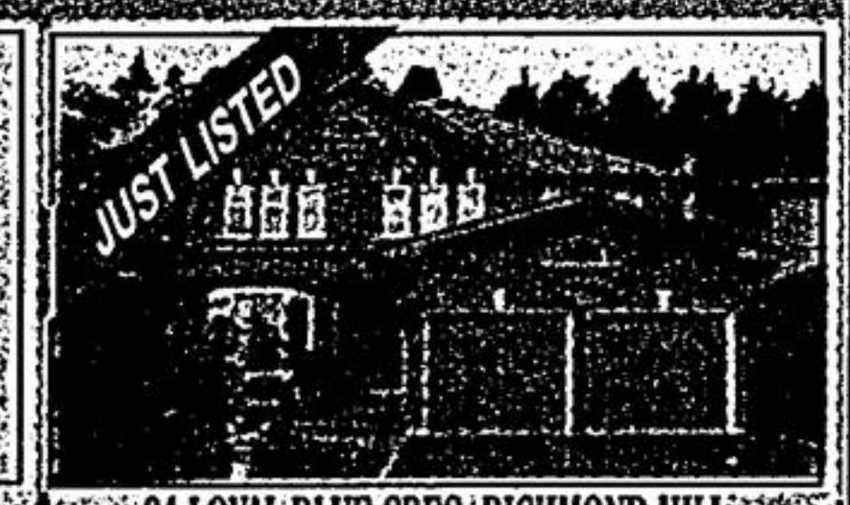
34 LOYAL BLUE CRES, RICHMOND HILL (WONGE & ELGIN MILLS) Muskoka view, Greenpark, approx 3300 sq. ft. of luxury, backs ravine, main flr den, Scarlett O'Hara staircase open to bsmt w/in landing, original owners, prof landscaped. $559,800.