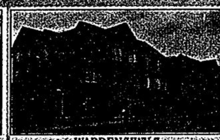
WARDEN/HWY 7 Excellent loc in downtown Markham w/lots of luxury residential & commercial development, great exposure w/extra wide frontage, total 3 units w/5 undergrnd pkg spaces, prof reno w/5 offices & 4 washrms. $499,000.