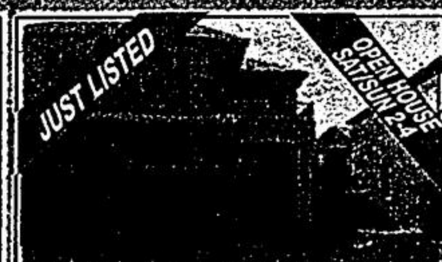
105 TRAIL RIDGE LANE Starlane built, fabulous semi-detached, steps from park overlooking pond & walking trails, upgrades galore. $336,800.