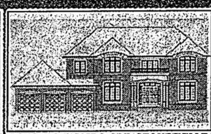
LOTS 4 & 5 CAIRO CRT, STOUFFVILLE (BLOOMINGTON/10TH LINE) Chivatti custom built, 2 storeys, approx 1.5 acs, approx 3580-4180 sq. ft. closing Apr/07. $879,000 - $949,000.