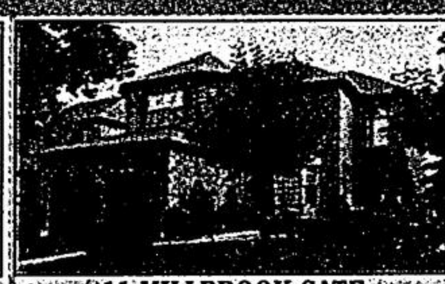
11 MILLBROOK GATE One-of-a-kind, approx 3000 sq. ft. of luxury, 9' ceilings on main flr, $$$ spent on upgrds, very desirable location, lrg principal rms, solid oak staircase, close to all amenities. $514,800.