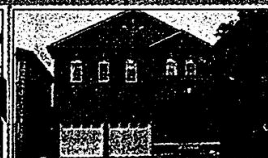
32 WILDBERRY CRES, VAUGHAN Fabulous family home in Vellore Woods, lovely upgrd kit w/3pc washrm, home recently reno'd, $$$ spent on upgrs, walk to all amenities, mins to Wonderland. $475,000.