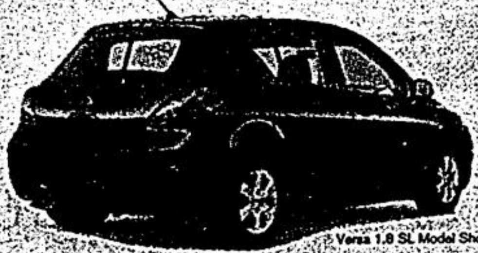
Versa 1.8 SL Model Shown

THE 2007 NISSAN VERSA ***** 5-STAR SAFETY RATING