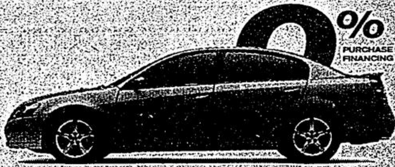
Altima 2.5 S with accessory spoiler shown

THE 2006 NISSAN ALTIMA 2.5 S WELL EQUIPPED AT $25,798 MSRP