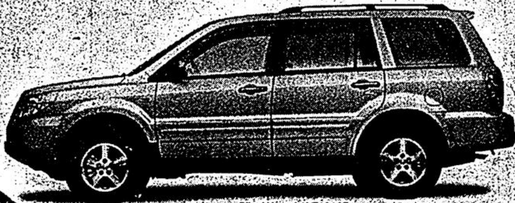
Pilot LX model YF1816E

Honda offers one of the most fuel efficient line-ups of vehicles.