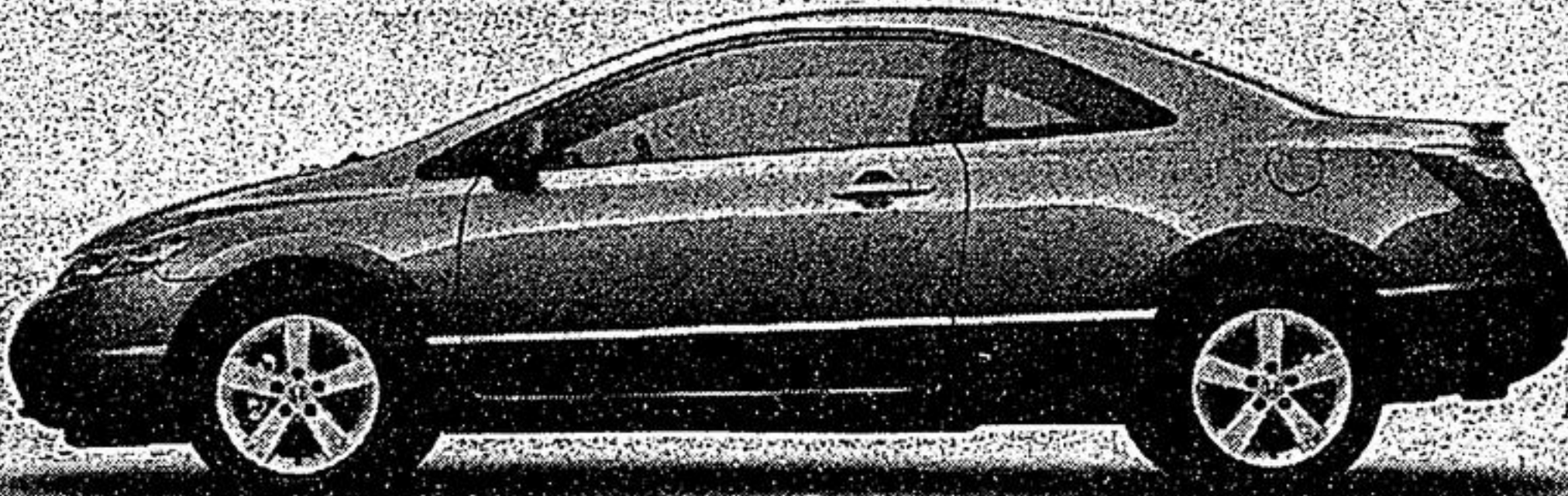
Civic Coupe LX model FG1166E