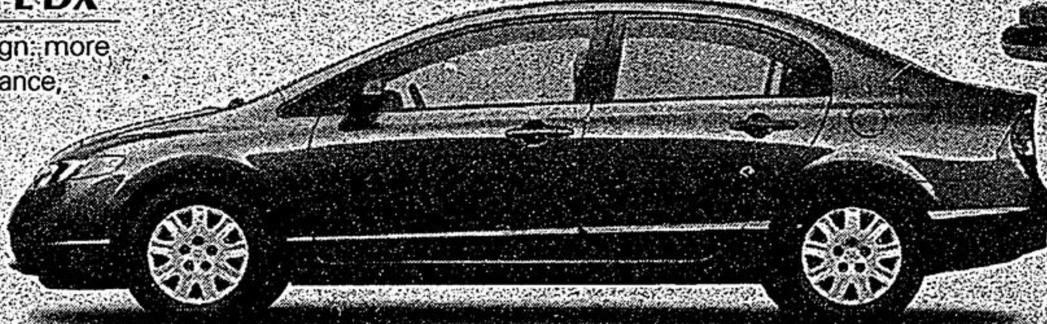
Civic Sedan DX model FA1526EX