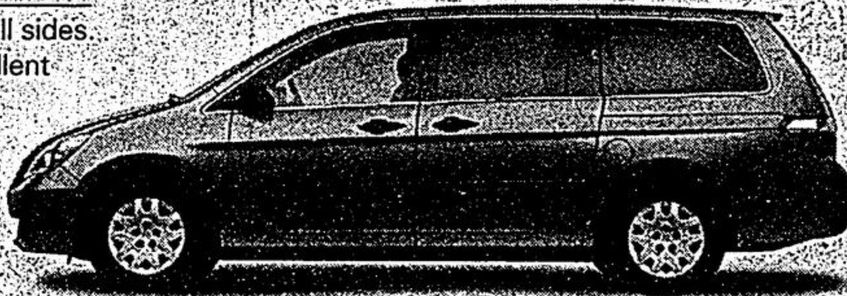
Odyssey LX model RL3826E