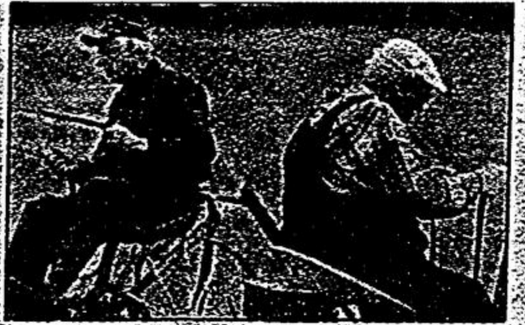
3 In praise of the plow: old, young meet their match