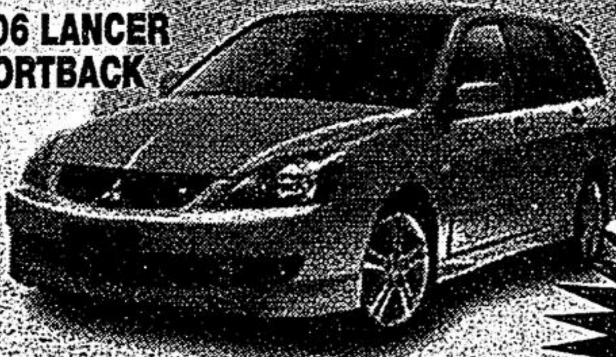
2006 LANCER SPORTBACK