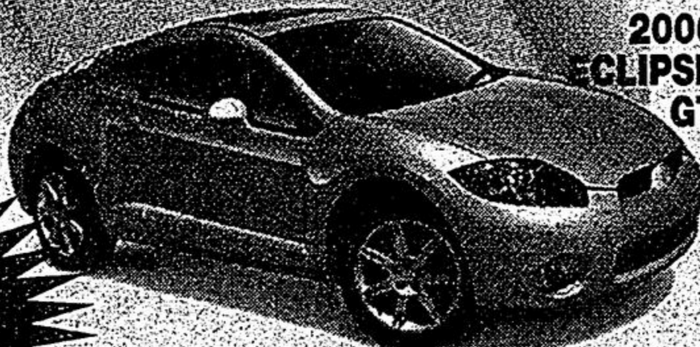
2006 ECLIPSE GT