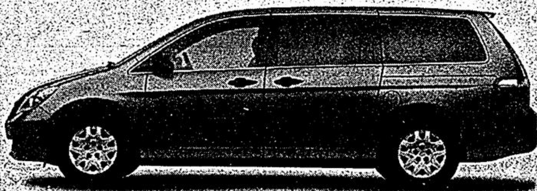
Odyssey LX model RL3826E

LEASE FOR LEASE APR $278 @ 1.9% PER MONTH FOR 48 MONTHS O.A.C. WITH $2,926 DOWN FREIGHT & P.D.E. INCLUDED. TAXES EXTRA $0 SECURITY DEPOSIT $24,200 MSRP