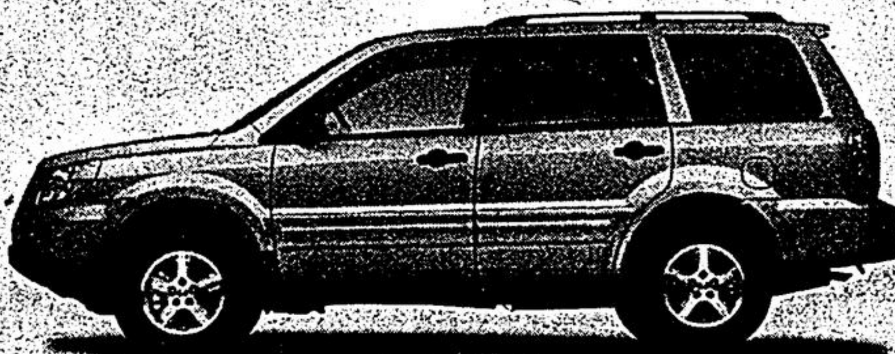
Pilot LX model YF1816E

LEASE FOR LEASE APR $388 @ 4.9% PER MONTH FOR 48 MONTHS O.A.C. WITH $4,873 DOWN FREIGHT & P.D.E. INCLUDED. TAXES EXTRA $0 SECURITY DEPOSIT $33,200 MSRP