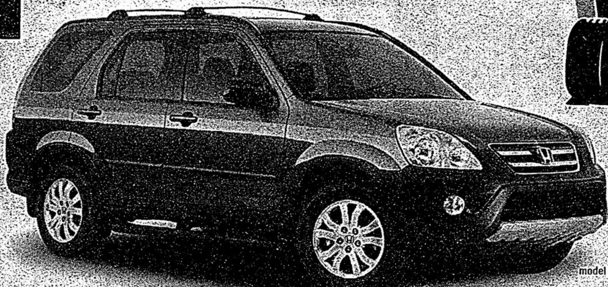
CR-V SE model RD7756EX