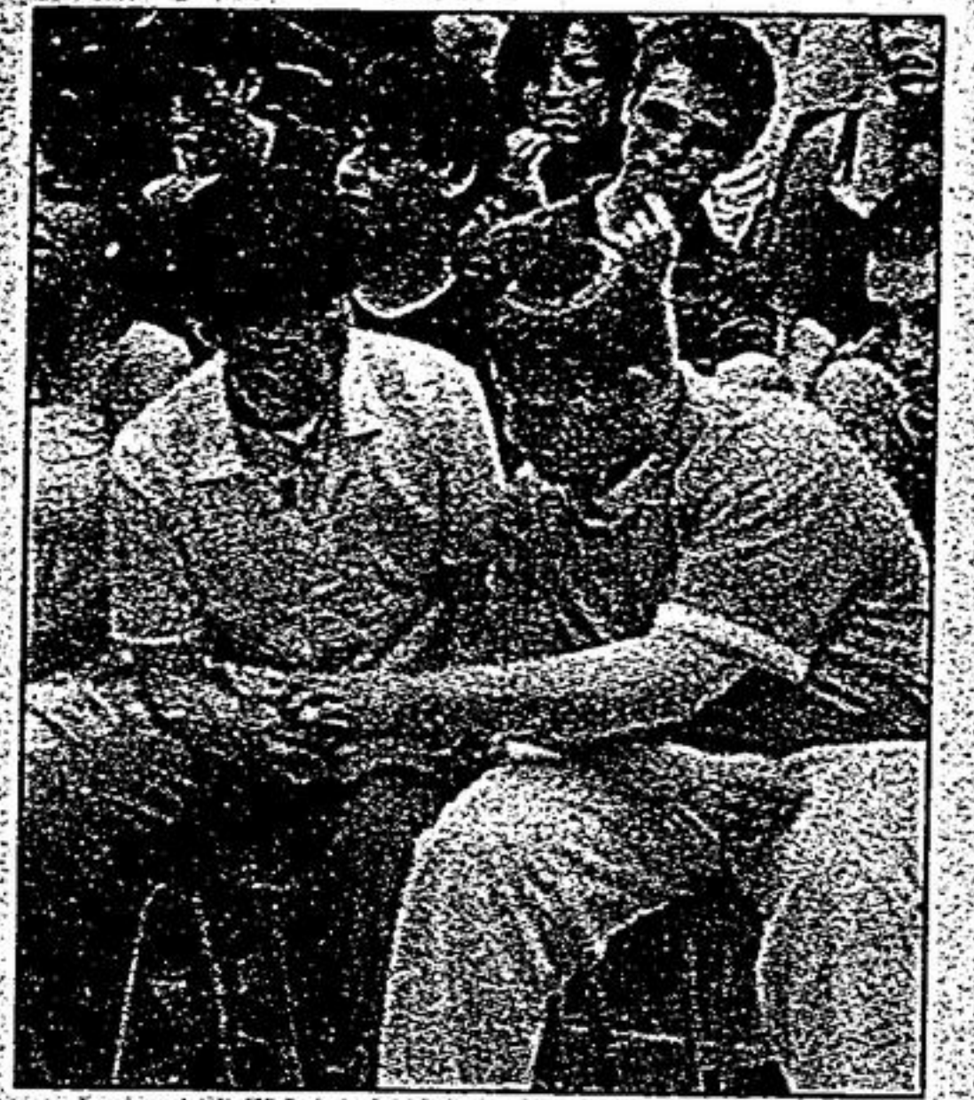
About 300 high school students listened to journalist Daniel Pearl's father speak about his son's murder.