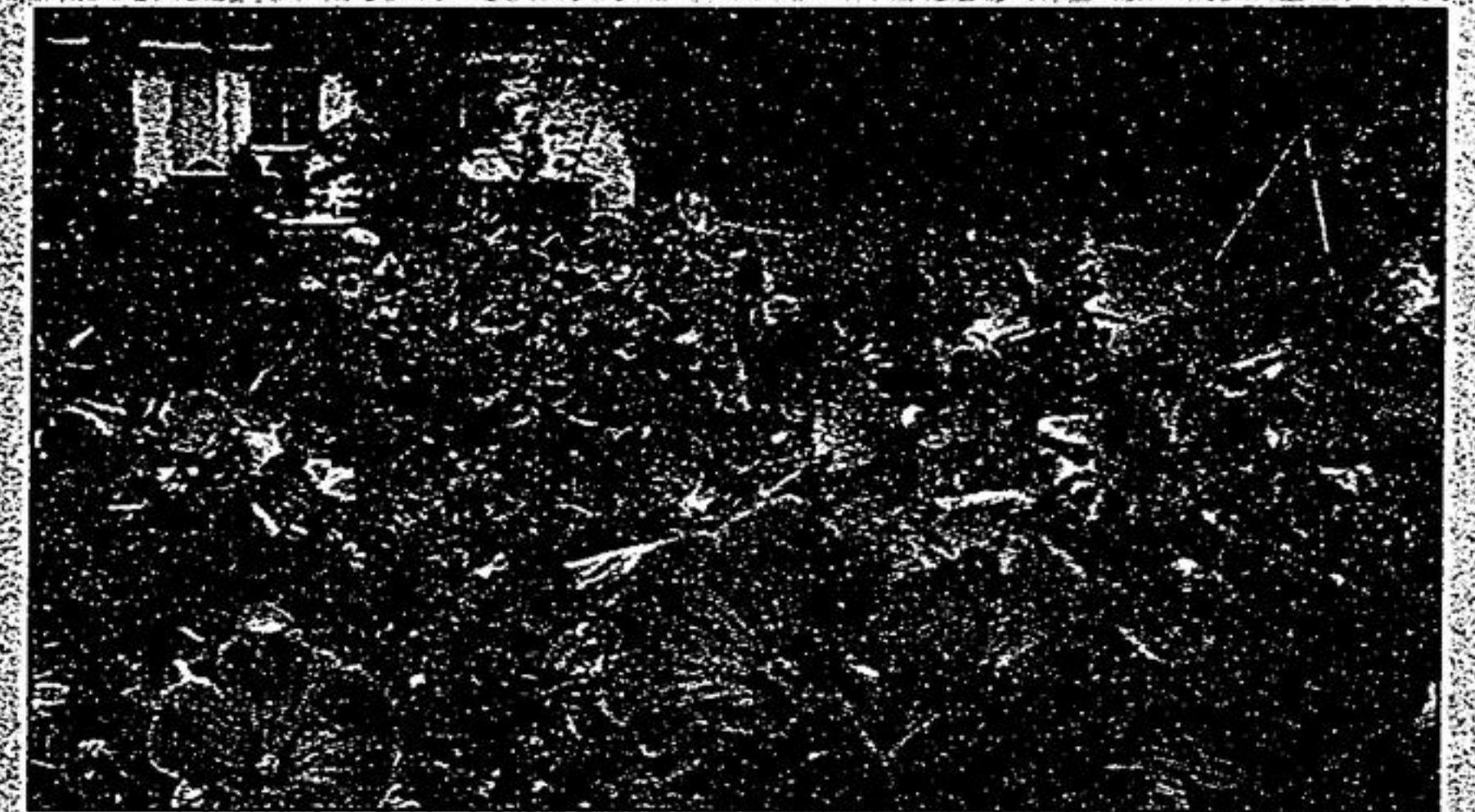
Even in June, there is still time to make a vegetable garden, and landscape a part of our yard into a flower garden.

Whether you are a novice gardener or an expert, gardening is a summer pleasure that is the most accessible to everyone, even children who will especially love eating what they have grown themselves.