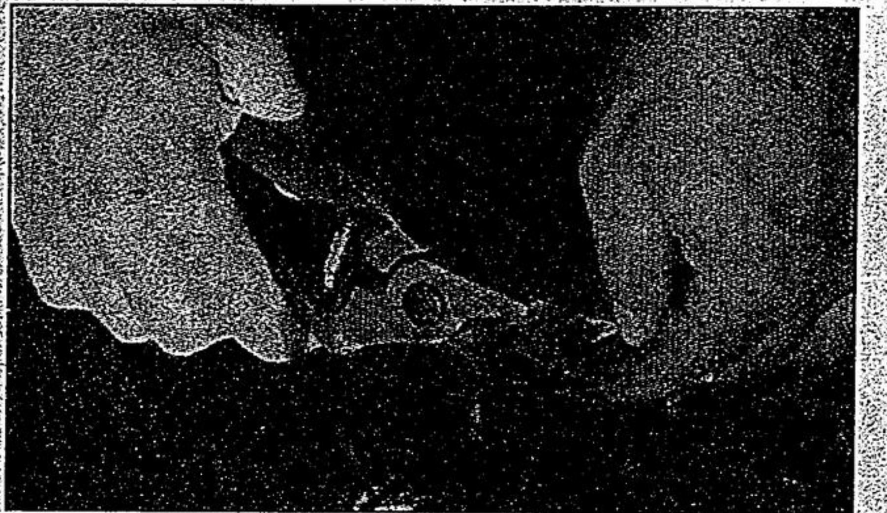
The best way to keep flowers that look and are healthy is to regularly clean plants by trimming the dried flowers and leaves.

Despite the fact that the plants are outdoors and benefit from rain, it's important to water them regularly. During a heatwave, a daily watering may be necessary. Just like grass, water after sunset to prevent the hot rays of the sun from burning leaves and flowers.