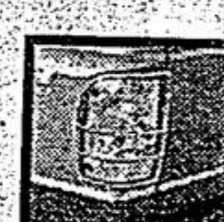
Tail Lamp Surround