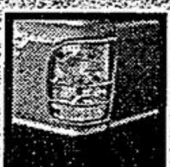
Tail Lamp Surround