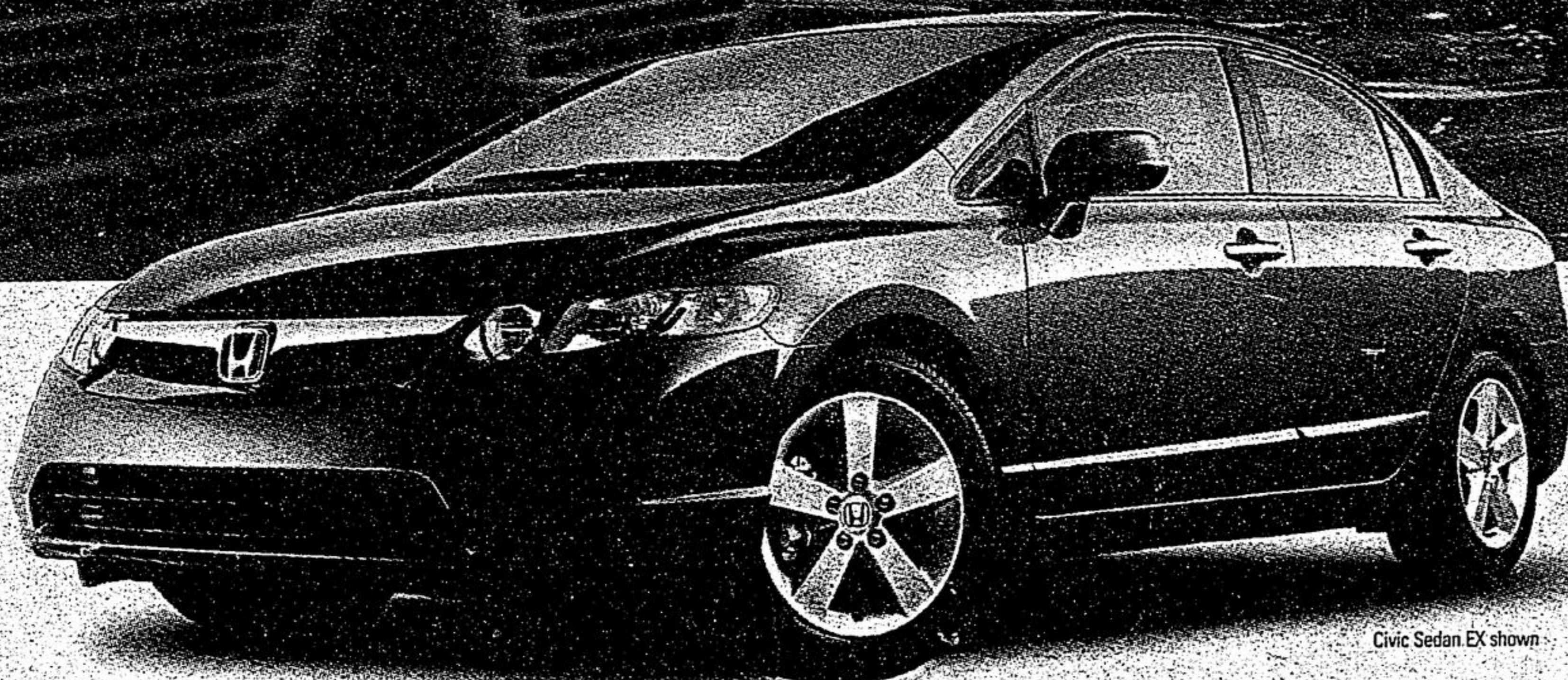
Civic Sedan EX shown