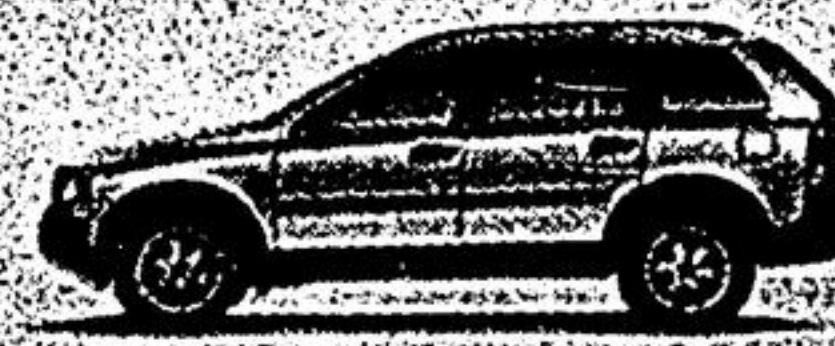
2006 XC90 2.5T

VOLVO VILLA 212 Steeles Avenue West • 1-888-246-9098 www.volvovilla.com