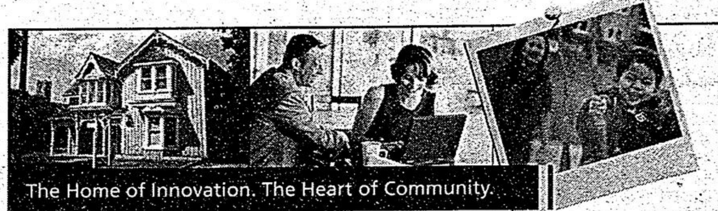
The Home of Innovation. The Heart of Community.

SIGN-UP ONLINE TODAY! www.torontomusicexpo.com Metro Toronto Convention Centre 255 Front St., W. Toronto