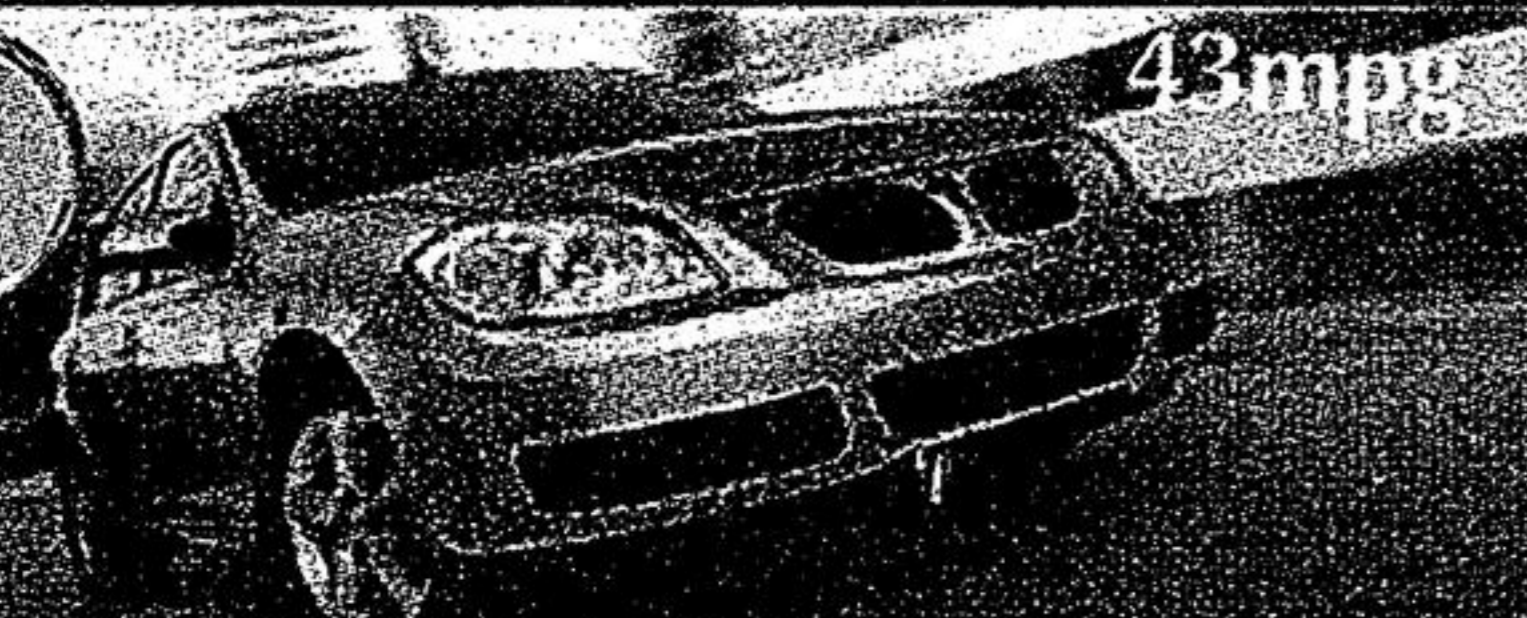
2005 Pontiac Pursuit