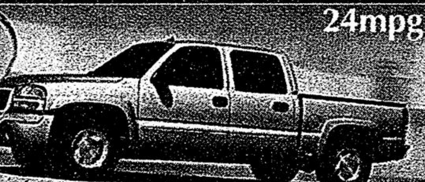
2005 GMC Sierra Crew Cab 4x4