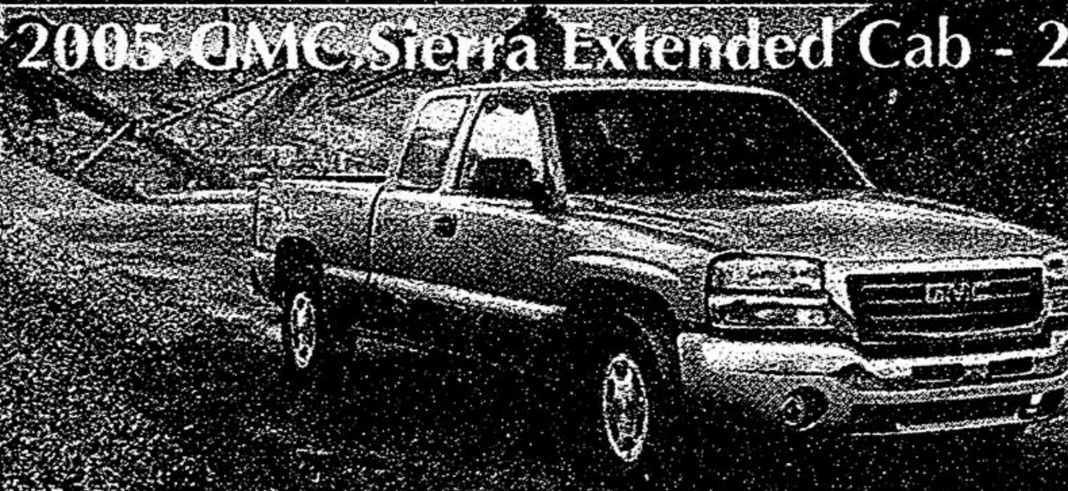
2005 GMC Sierra Extended Cab - 27mpg