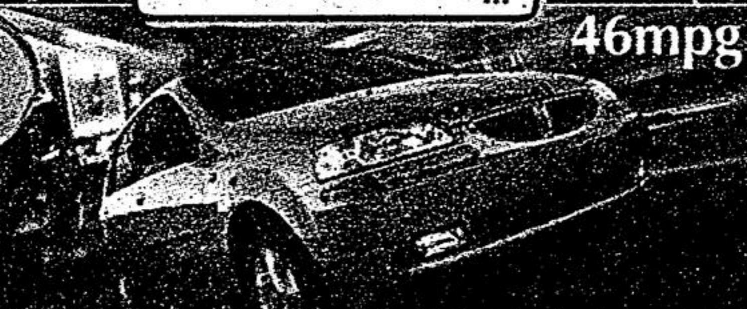
2005 Pontiac Wave