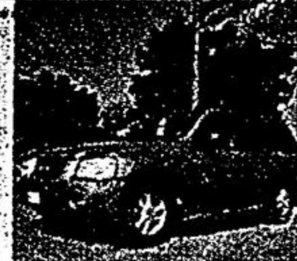
2003 Grand Am SE Sedan

• Air conditioning • Pwr windows • Pwr locks • Cruise Control • V6 engine • AM/FM CD • Stereo • Running Boards • Tinted glass • Only 36,000 km's Stk# P2978