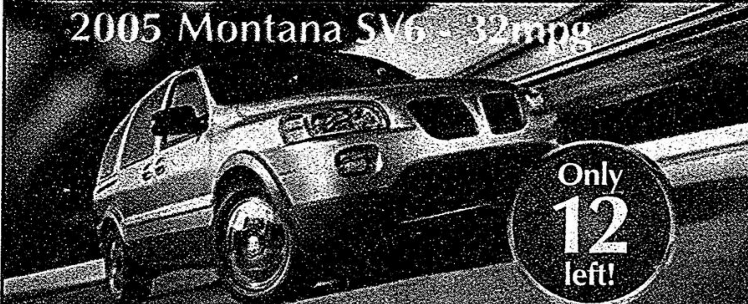
2005 Montana SV6 - 32mpg