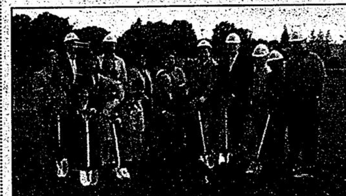
Official Ground Breaking