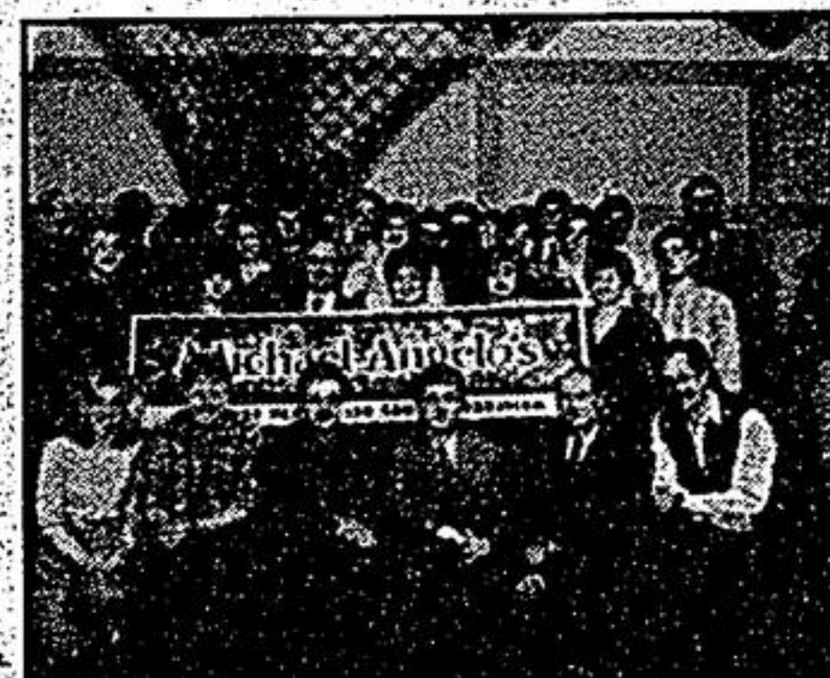
Name Launch, 1985