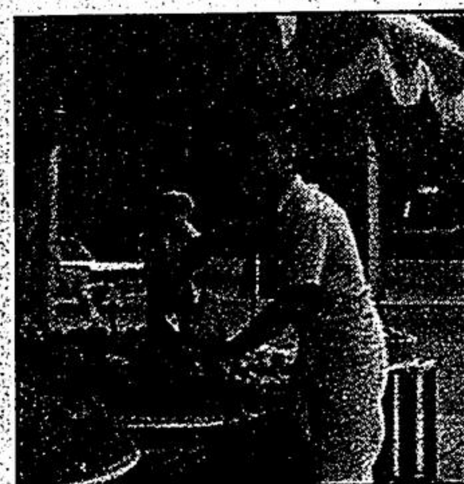
The Early Years

Effective immediately, residents of Markham and the surrounding area can experience the true essence of European market-style grocery shopping only minutes from home.