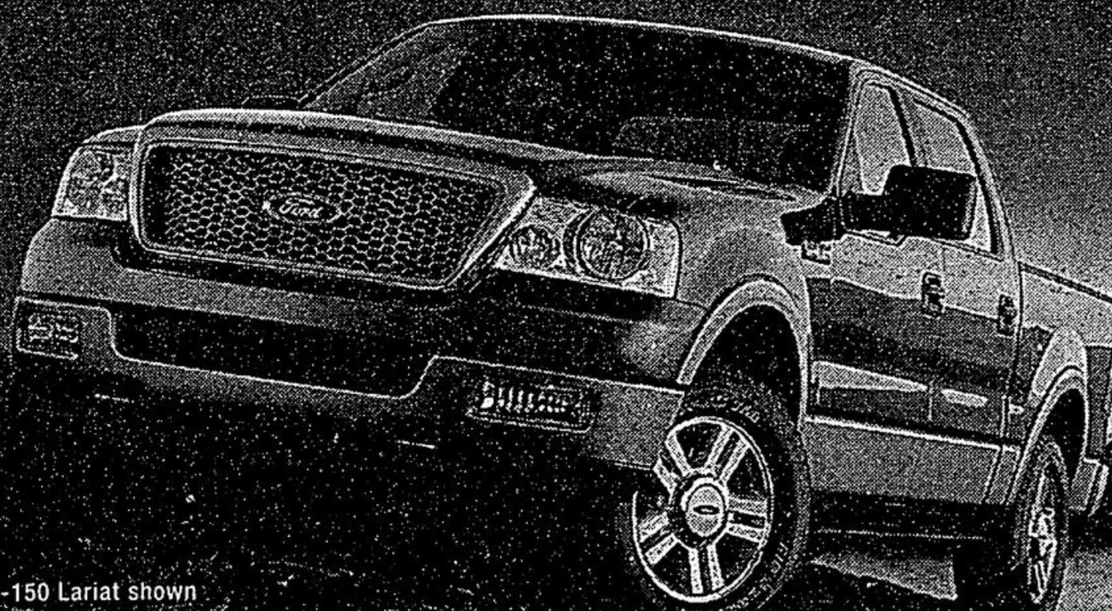
2005 F-150 Lariat shown

(LAST CHANCE TO GET EMPLOYEE PRICING ON MOST REMAINING 2005s.)