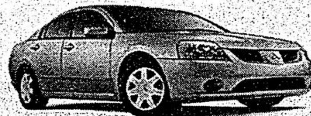
2005 GALANT ES