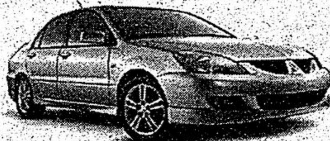
2005 LANCER RALLIART