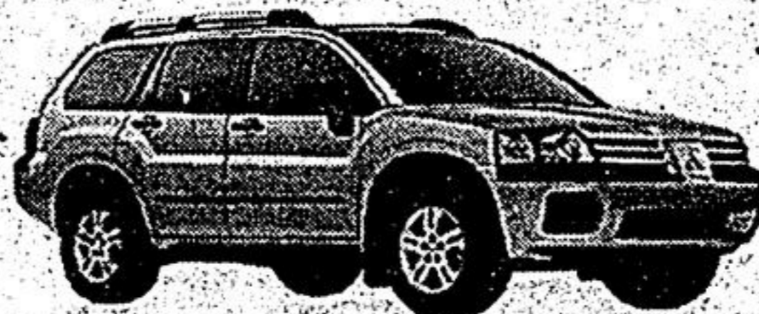
2005 ENDEAVOR LS