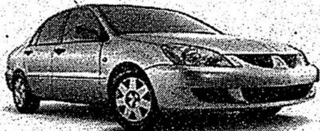
2005 LANCER ES

10-year/160,000 km Powertrain Limited Warranty* 5-year/100,000 km New Vehicle Limited Warranty* 5-year/Unlimited km Roadside Assistance*