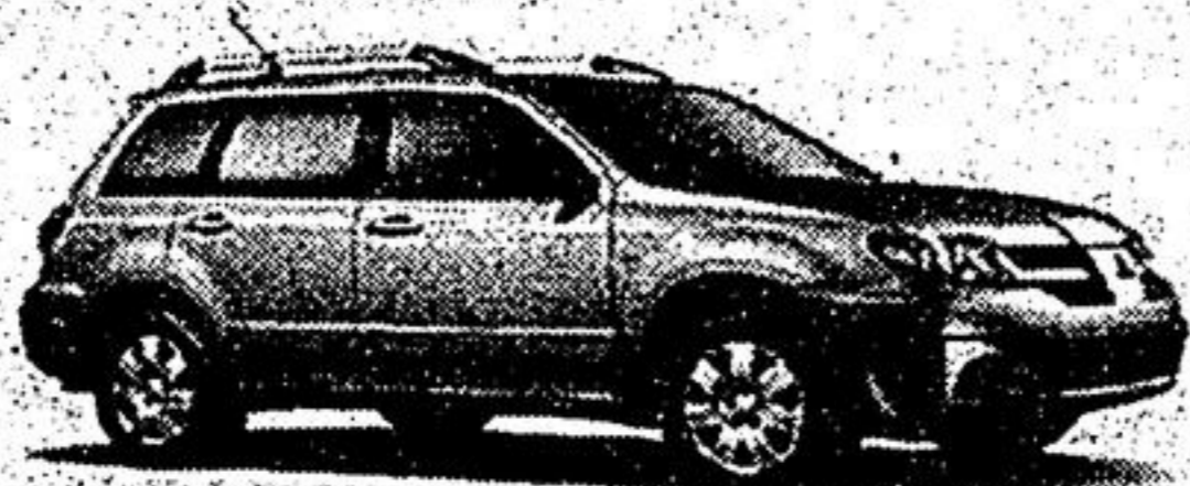
2005 OUTLANDER LS